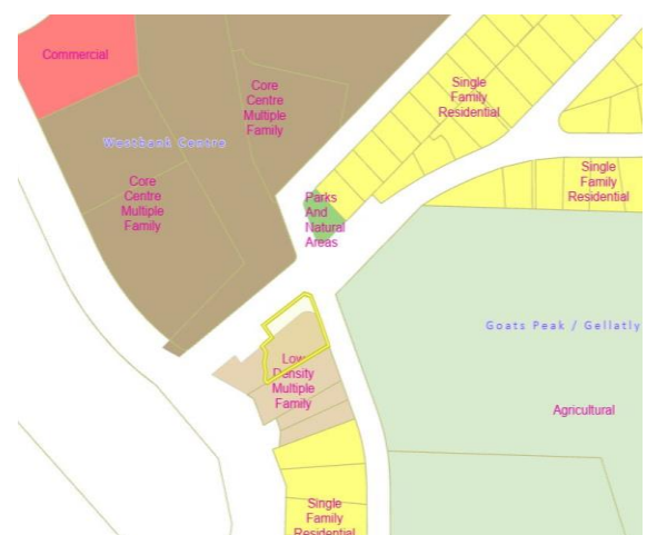
Figure 1 – West Kelowna neighbourhoods and Official Community Plan land use designations. Subject property shown by red dashed lines.

Staff have been working with the applicant on the Development Permit for the proposed buildings at the applicant's request and anticipate that variances will be required to accommodate the proposal. These requests would be considered in the future with the Development Permit application.