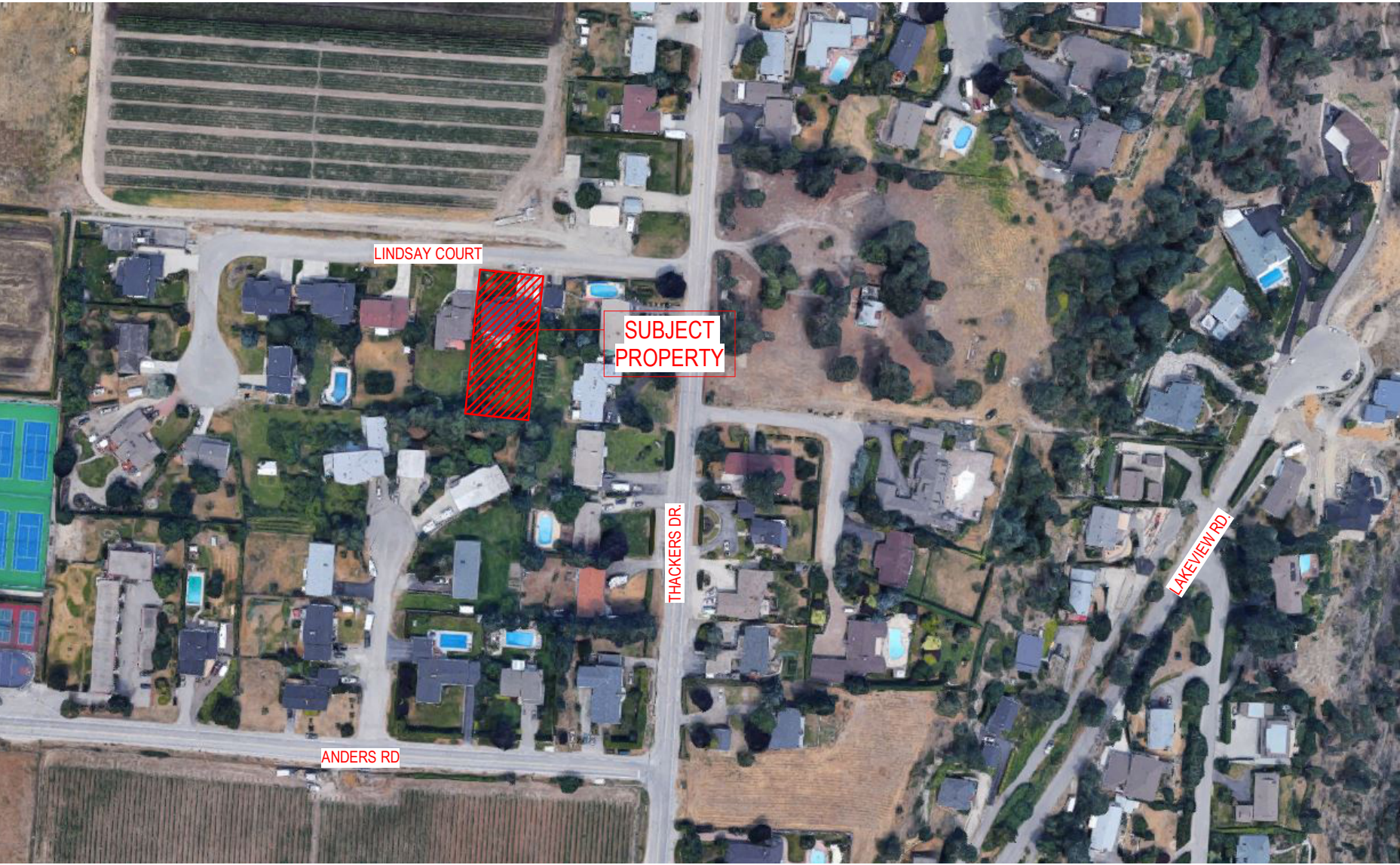
LOCATION PLAN - N.T.S.