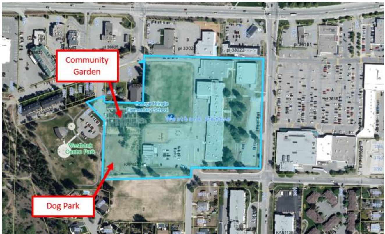
Figure 1 – Existing Dog Park and Community Garden location in Westbank Centre Park