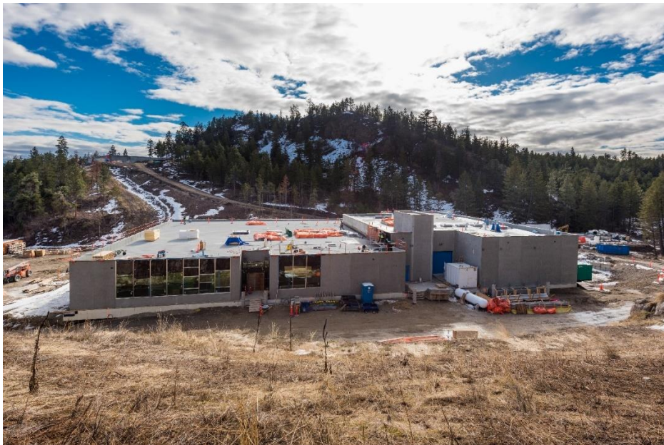
Figure 2. Water Treatment Plant (back)