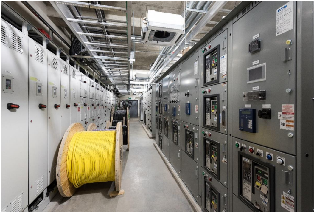
Figure 5. Electrical Room