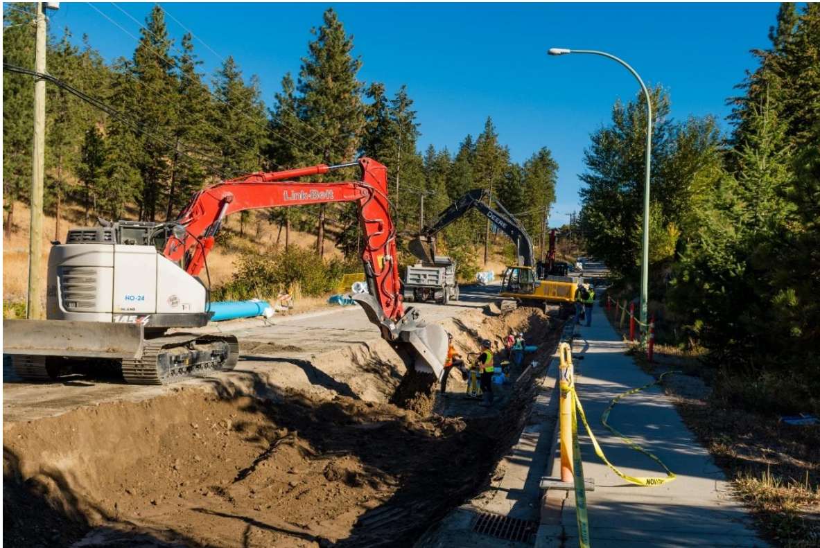
Figure 9. Transmission Mains Construction on Westlake Road