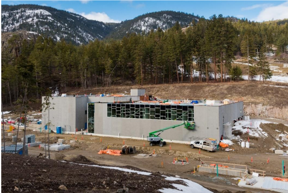
Figure 1. Water Treatment Plant (front)

priority, however, some delays have been unavoidable. The plant is now currently scheduled to be substantially complete early fall 2023. Substantially complete includes commissioning which will be an incredibly involved process for a plant of this size and will take months to complete. Once the plant is substantially complete, residents will receive drinking water that exceeds Provincial Guidelines for drinking water.