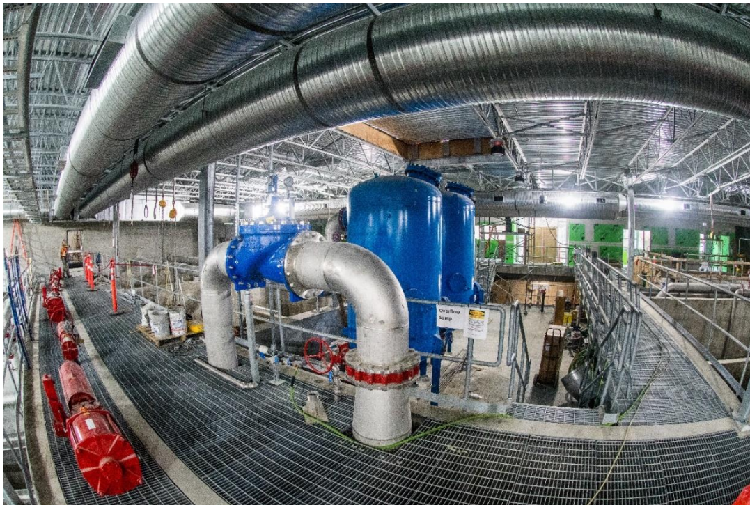
Figure 4. Dissolved Air Flotation Saturator Tanks