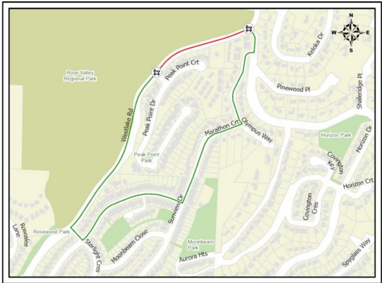
Figure 8. Westlake Road Detour

Work on the Menu Road section is currently scheduled to begin again the week of March 13 th . Letters will be sent to the community in late February and a public meeting will be held in early March to discuss a traffic management plan for the neighbourhood.