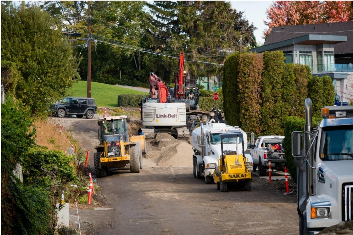
Figure 10. Transmission Mains Construction on Menu Road