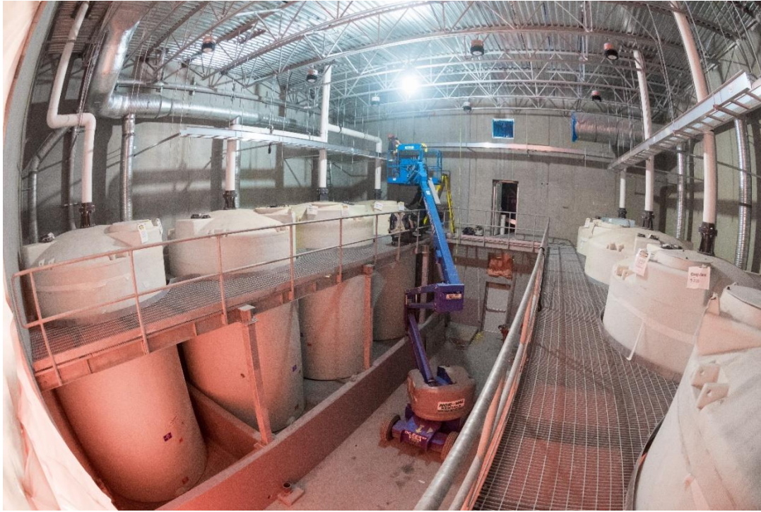
Figure 3. Chemical Storage Room