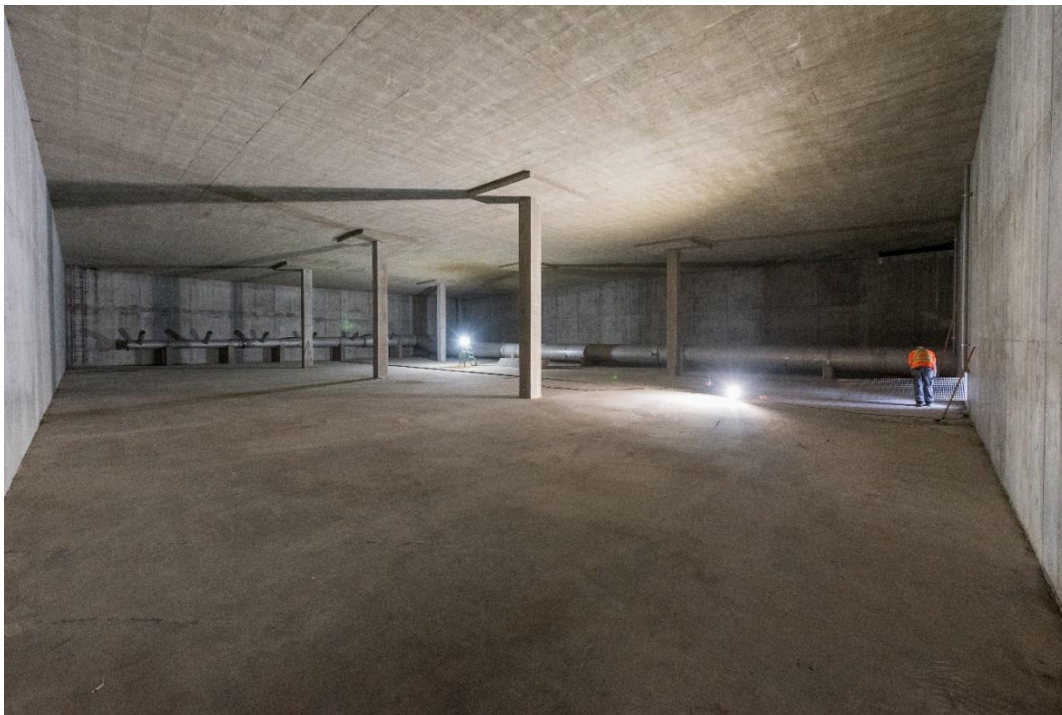
Figure 6. Treated Water Reservoir