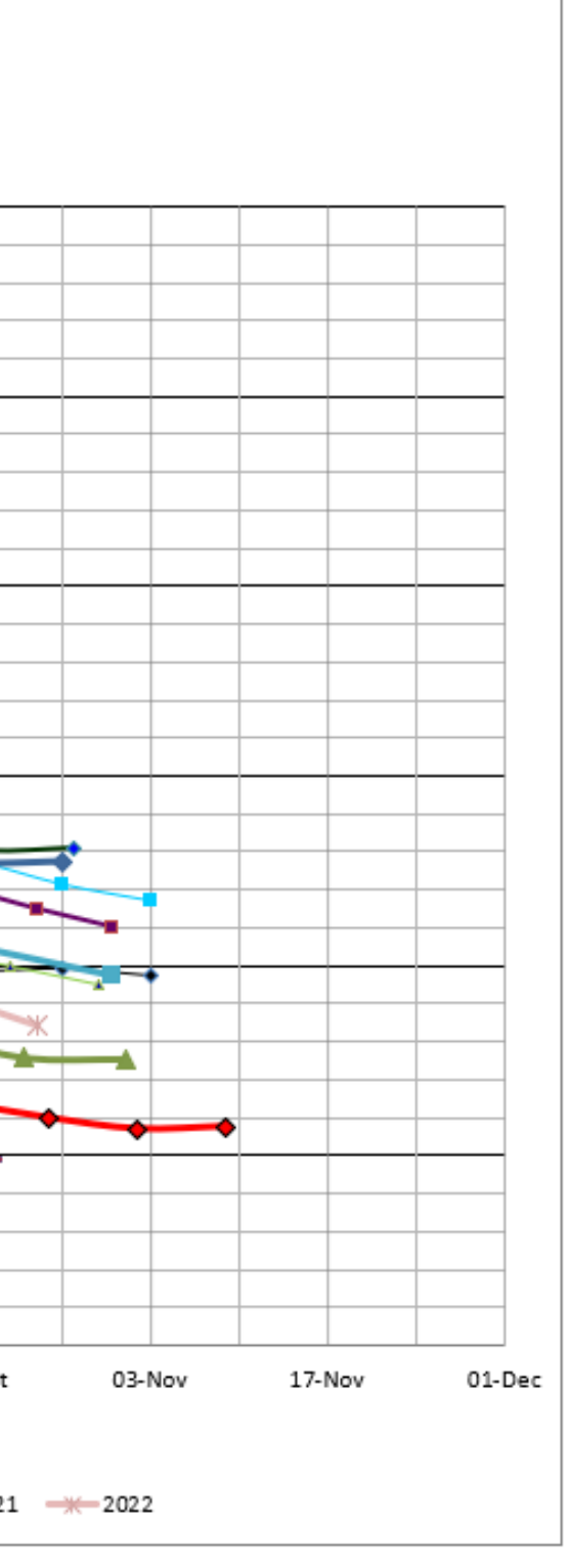
FIGURE 1 – Total Reservoir Storage

2009-Present Peak Period Total Reservoir Storage for CWK Upper Lakes WID Grid 9500 8500 g Storage (acre-feet) 2009 2009 녙 ain Re Total B 4500 3500 19-May 02-Jun 16-Jun 30-Jun 14-Jul 28-Jul 11-Aug 25-Aug 08-Sep 22-Sep 06-Oct 20-Oct Date