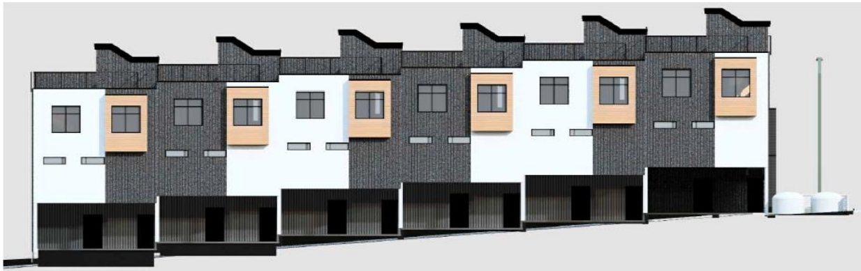
Figure 4: north elevation (interior)