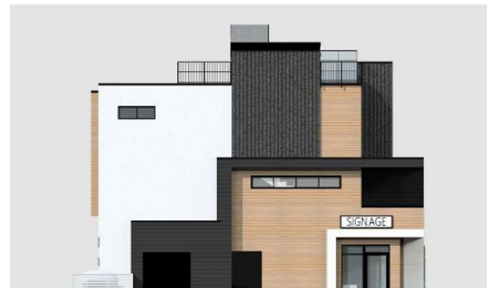
Figure 3: west elevation (front, Elliott Road)