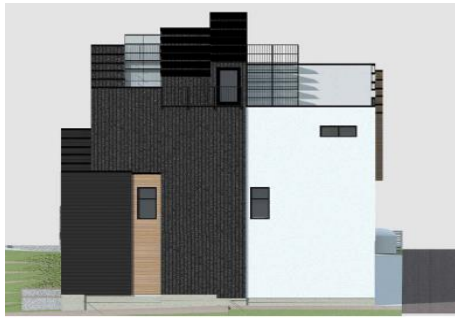
Figure 2: east elevation (rear)