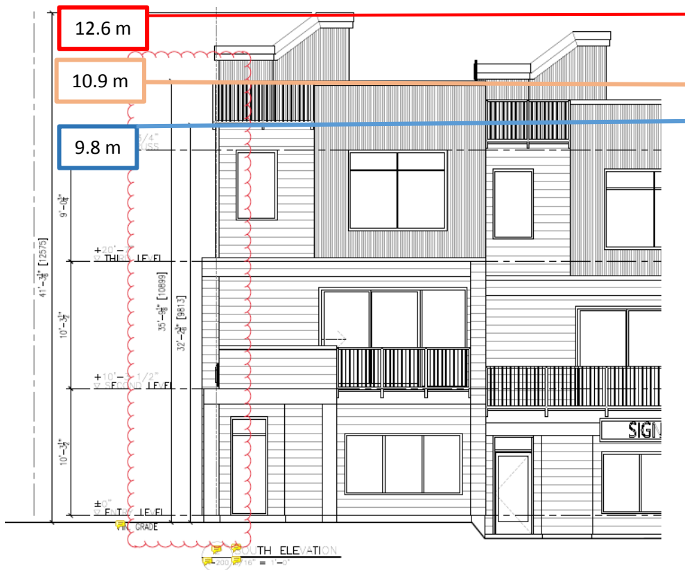
Figure 6: proposed building height (Springer Lane elevation).