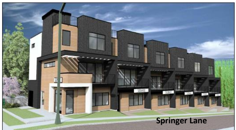
Figure 1: rendering of building from corner of Elliott Rd and Springer Lane

Above the ground floor commercial, the units are proposed to contain a kitchen and living space on the second level, bedrooms on the third level, and a rooftop patio. Units 1 and 6 are proposed to contain three bedrooms and units 2-4 are proposed to contain two bedrooms and a den ( Attachment 2 ).