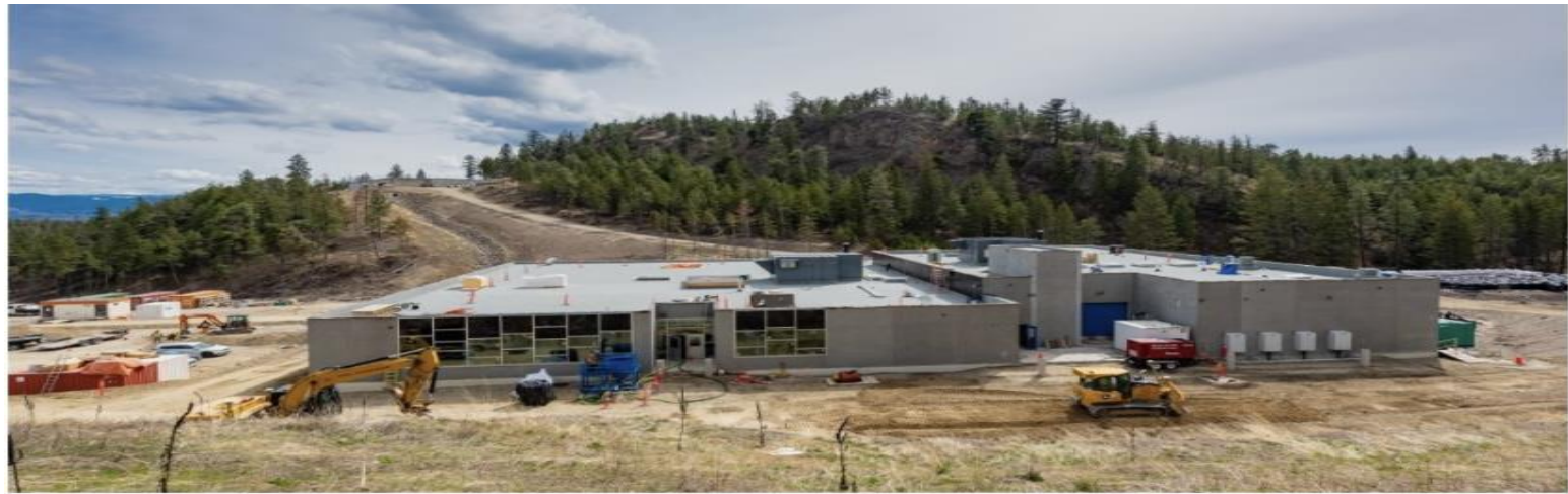
Rose Valley Water Treatment Plant