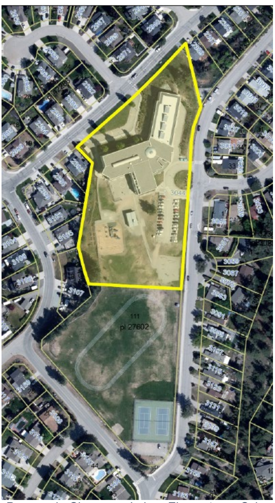
Proposed Shannon Lake Elementary School "school related footprint" shown in yellow.

The approximately 1.6 hectare proposed school footprint covers the established school, portables, playground, parking, and drive aisles. The existing tennis courts, operated by the City of West Kelowna, have not been included in this footprint. The proposed School Footprint leaves approximately 42% of the undeveloped ALR lands, the school fields, available for agricultural purposes.