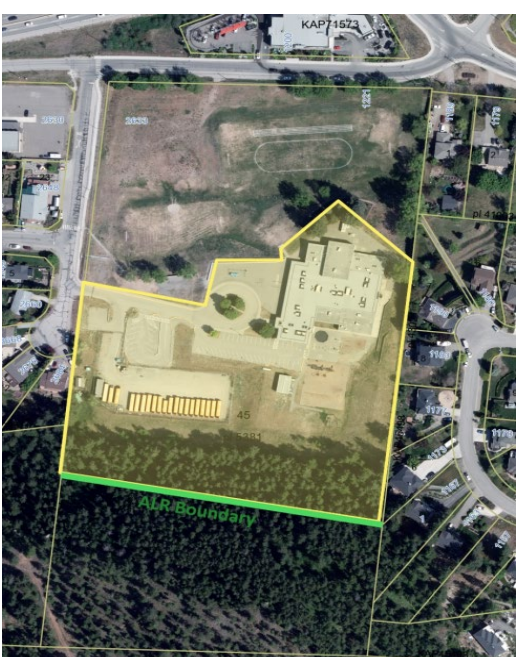
Proposed Hudson Road Elementary School "school related footprint" shown in yellow.

The proposed approximately 3.3 hectare school footprint includes the steep slopes behind the school, the existing school structures, parking, playground, and drive aisles. The existing retaining walls on the northern boundary of the footprint were utilized as the school footprint boundary. The proposed school footprint leaves approximately 42% of the undeveloped ALR