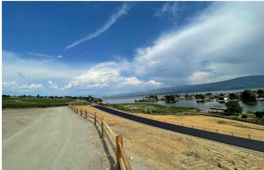
Figure 3: Quails Gate to Green Bay June 27, 2023

Additional improvements that are either underway or yet to be completed on Phase 1 include a safety/aesthetic looking split rail fencing, signage, strategically placed solar lighting and trailhead improvements, garbage receptacles and dog waste bag stations will also be considered. This all is expected to be complete by October 2023 and in line with the completion of the Ogden to Gregory Phase 2 project.