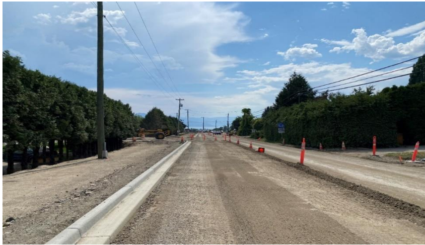
Figure 4: Prepping for Pavement June 27, 2023