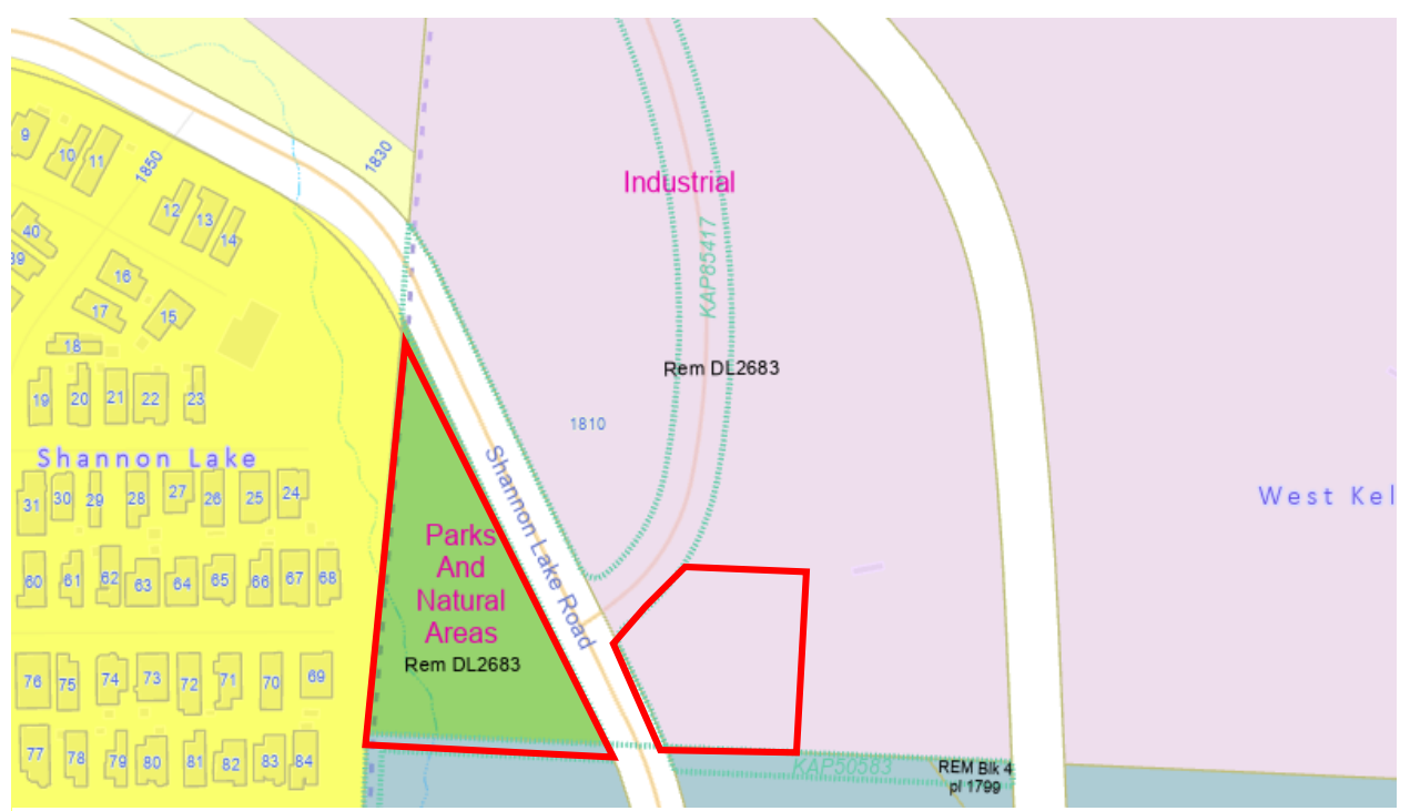
Figure 2: Existing Land Use Designations and affected portion of property.

The specific area of the subject property affected by the proposal contains Industrial and Parks and Natural Areas Land Use Designations (LUDs). The portion of the property west of Shannon Lake Road contains the Parks and Natural Areas LUD and the portion of the site east of Shannon Lake Road contains an Industrial LUD (Figure 2).