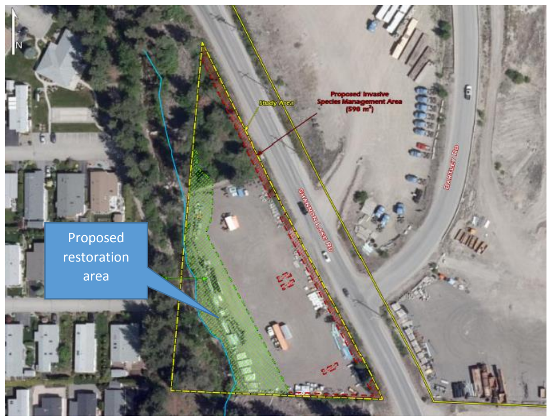
Figure 3: Restoration area adjacent to McDougall Creek