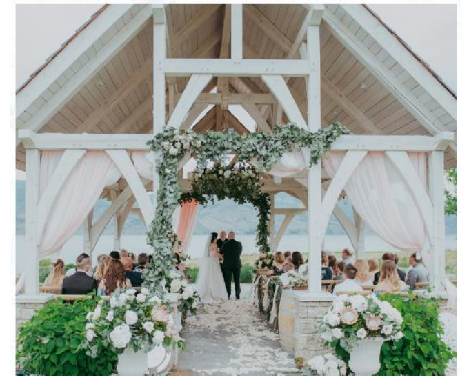
Figure 2: Sanctuary Garden Photos