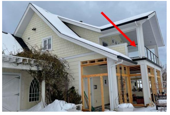
Figure 2: Above ground patio facing south towards the lake.