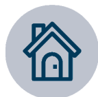
VIOLENCE IN RELATIONSHIPS