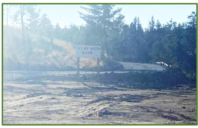
Figure 5: Sign Stating, "Dump over Bank"

During this applications' duration, bylaw complaints were received regarding the subject property. First, staff were made aware that the hydrovac vehicles had been dumping materials on the property (See Figure 5). The applicant has since removed the sign and stopped these works, dumping a hydrovac vehicle on the lot is not a permitted use in Agricultural Zone. applicant was made aware to not operate on 2004 Bartley