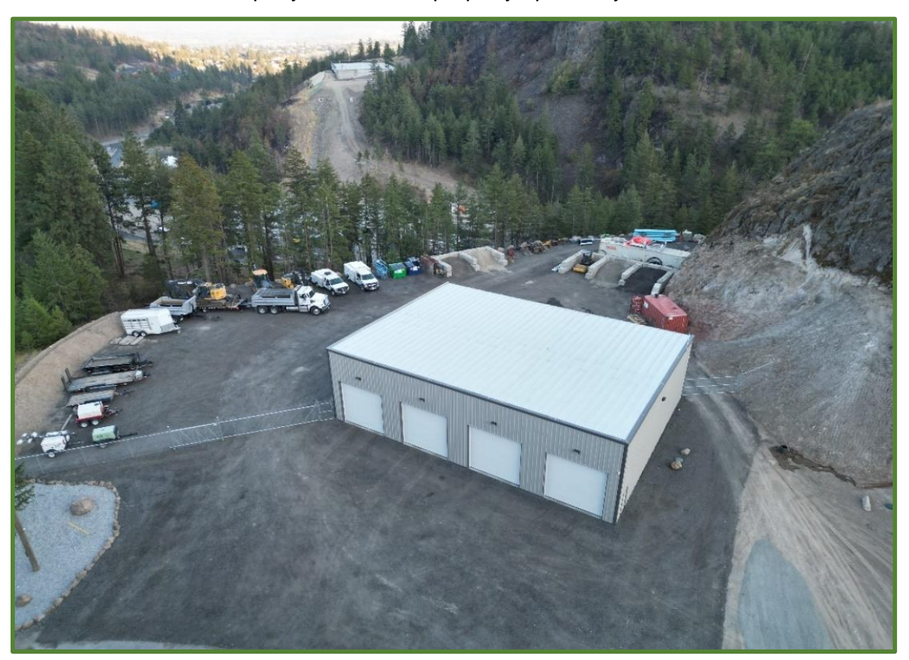
Figure 2: Drone Photo (Dated 09 - 22, 2023)

Industrial use than strictly equipment storage. It was made clear during our APC meeting that the applicant plans on not limiting the amount of heavy and industrial vehicles that will be stored in this 1-acre area. Currently, they have stated that the number of vehicles and equipment will be 18+ with no proposed cap. These adjustments to the application may have serious ramifications for nearby homeowners and true agricultural uses, such as the Niche Wine Company north of this property up Bartley Road.