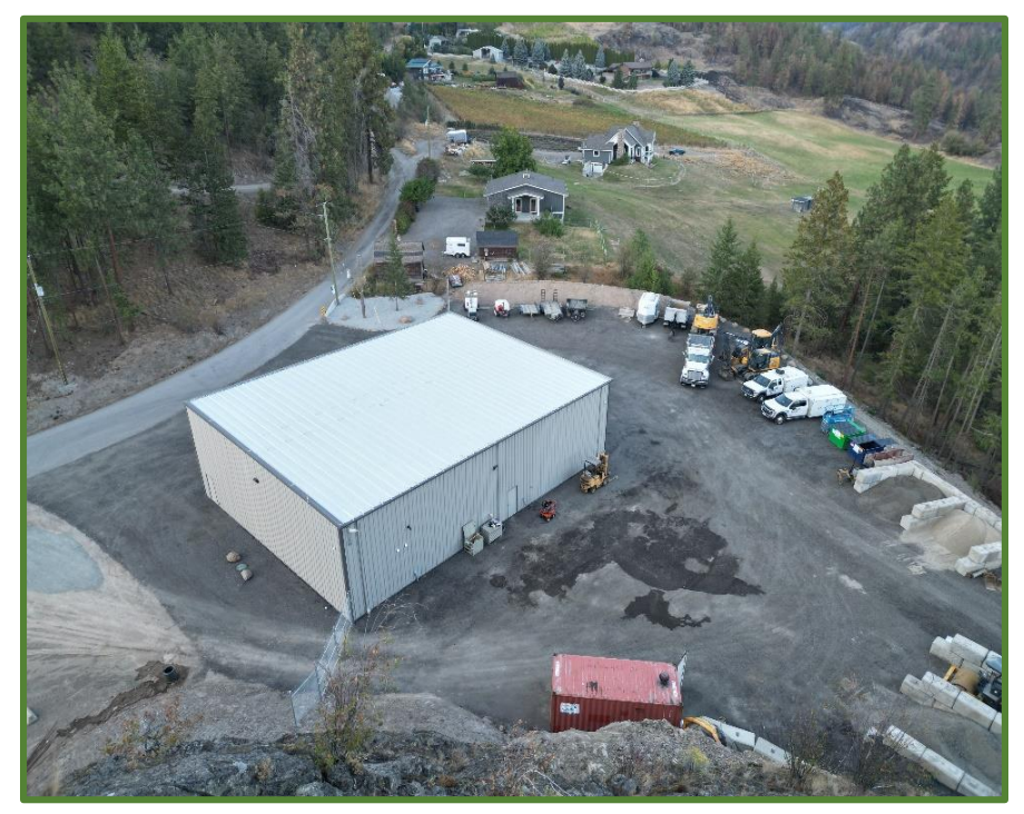
Figure 4: Drone Photo (Dated 09 - 22, 2023)

The proposed site-specific text amendment application does not meet the above regulations in the Zoning Bylaw. The proposal is for storage of more than four vehicles equipment or (approx. 18+ vehicles and equipment) in an area larger than 300 m<sup>2</sup> (4,047 m<sup>2</sup>) and with a less than 15m setback from the northern side parcel boundary (See Attachment 3). The excess number of industrial vehicles on the property is roughly 4.5 times permitted number of heavy vehicles and equipment permitted in an A1 zone.