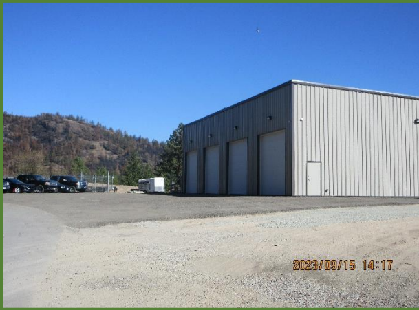
Figure 6 & 7: Bylaw Visit (Dated 09-15, 2023)