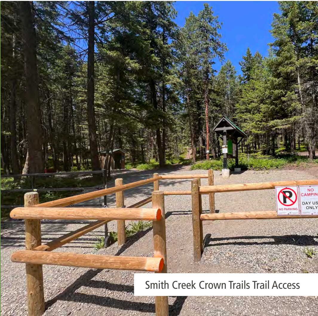
Smith Creek Crown Trails Trail Access