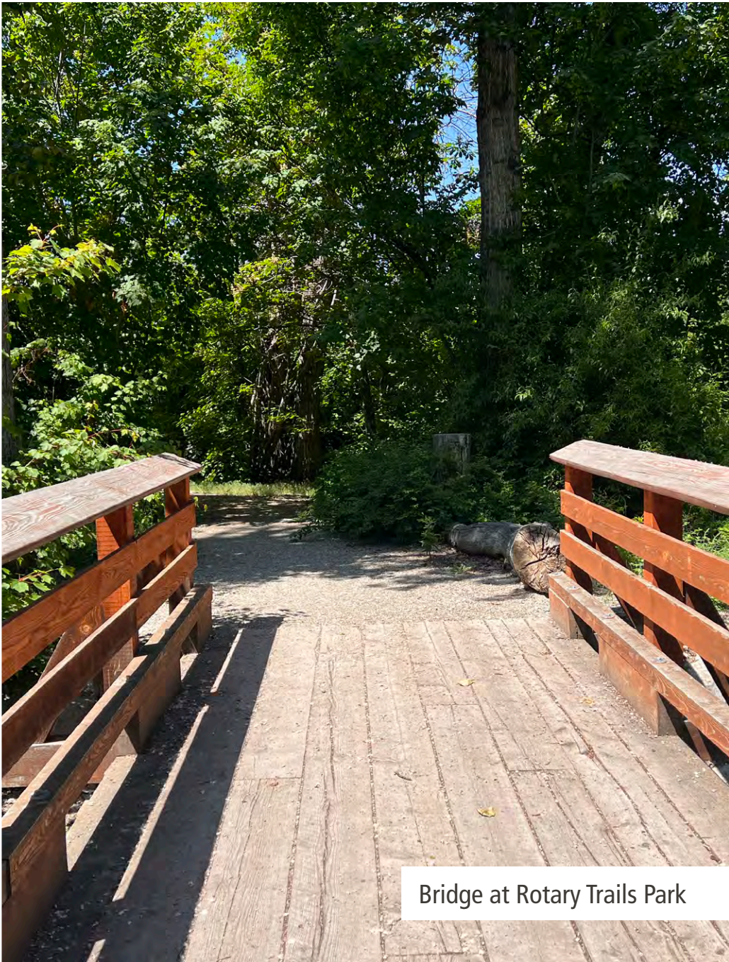
Bridge at Rotary Trails Park