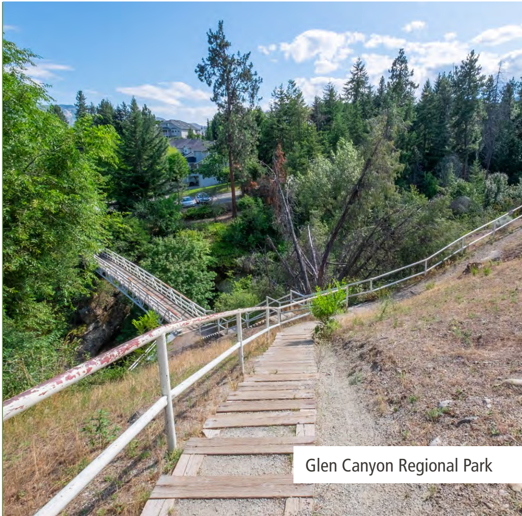
Glen Canyon Regional Park