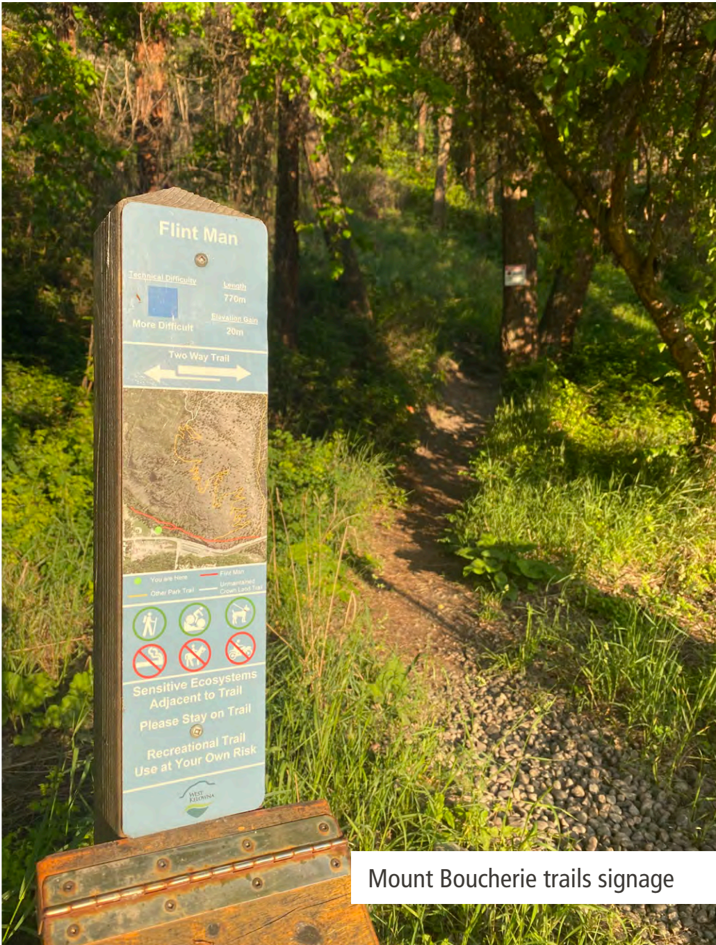
Mount Boucherie trails signage