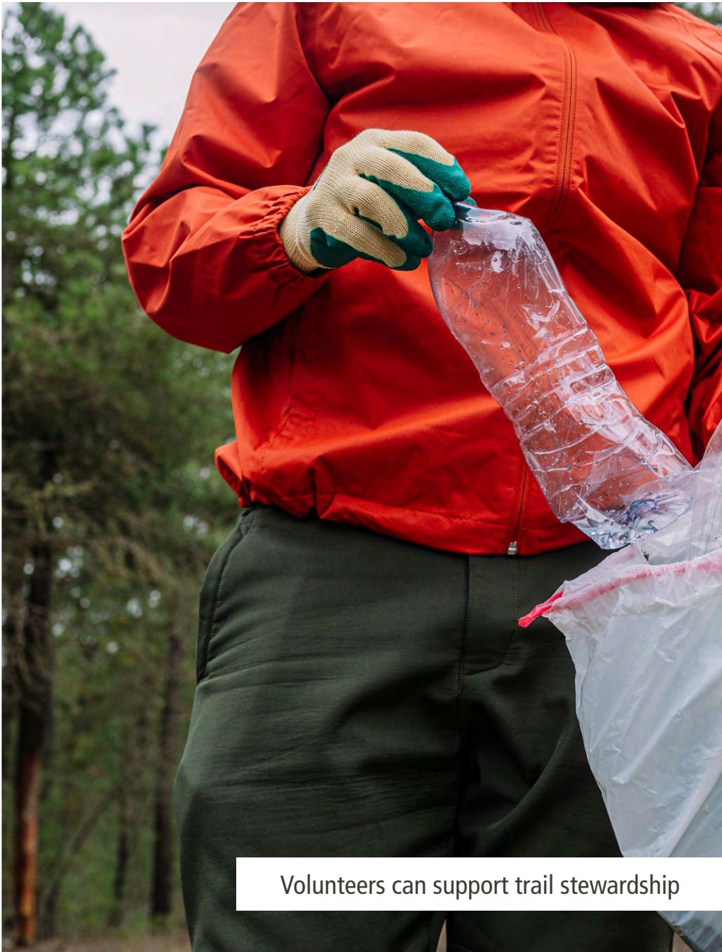
Volunteers can support trail stewardship