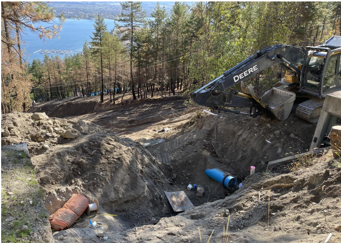
Figure 9. Transmission Mains Construction on Westlake Road