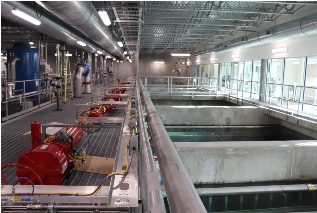
Figure 6. Filter Tanks