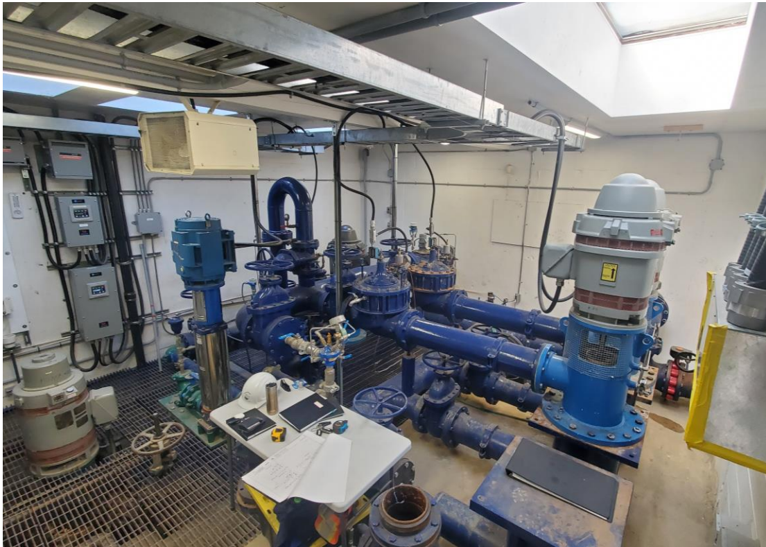
Figure 8. Menu Road Pump Station