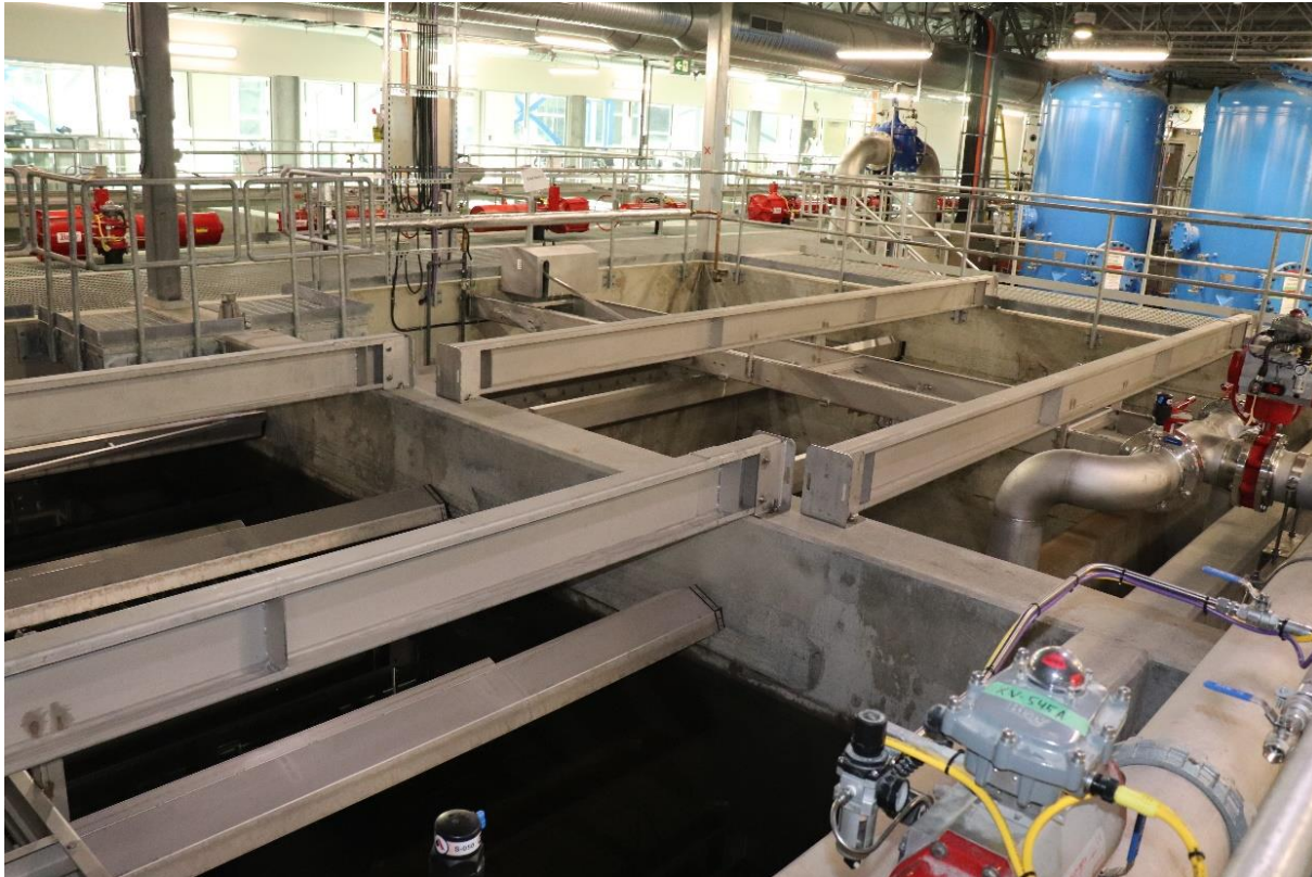
Figure 5. Dissolved Air Flotation Tanks