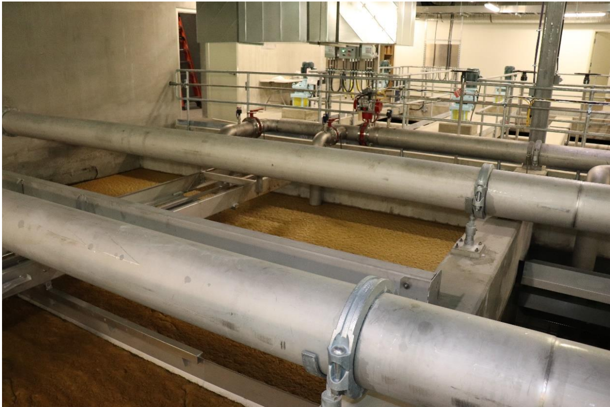
Figure 4. Dissolved Air Flotation Tank & Skimmer