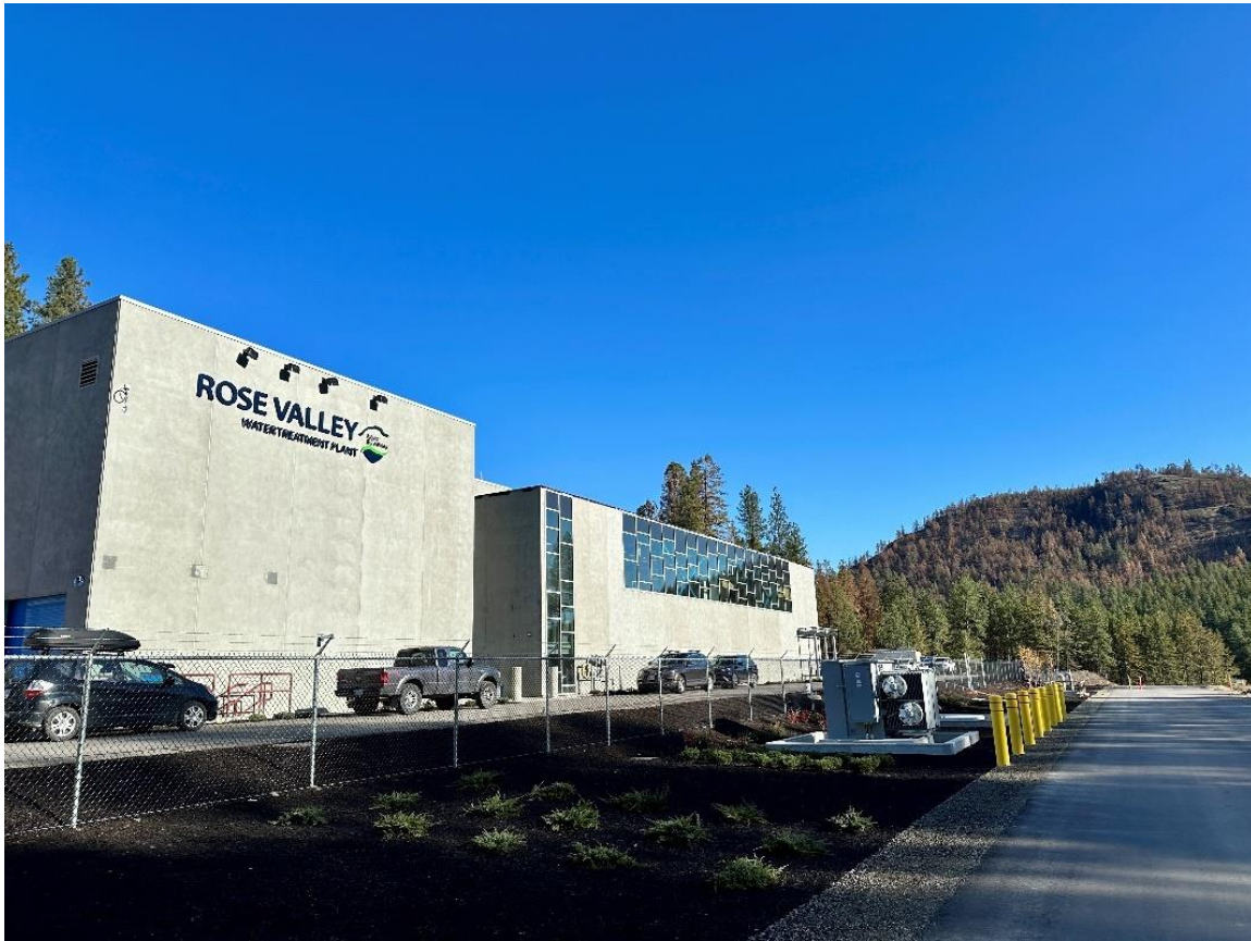
Figure 2. Rose Valley Water Treatment Plant