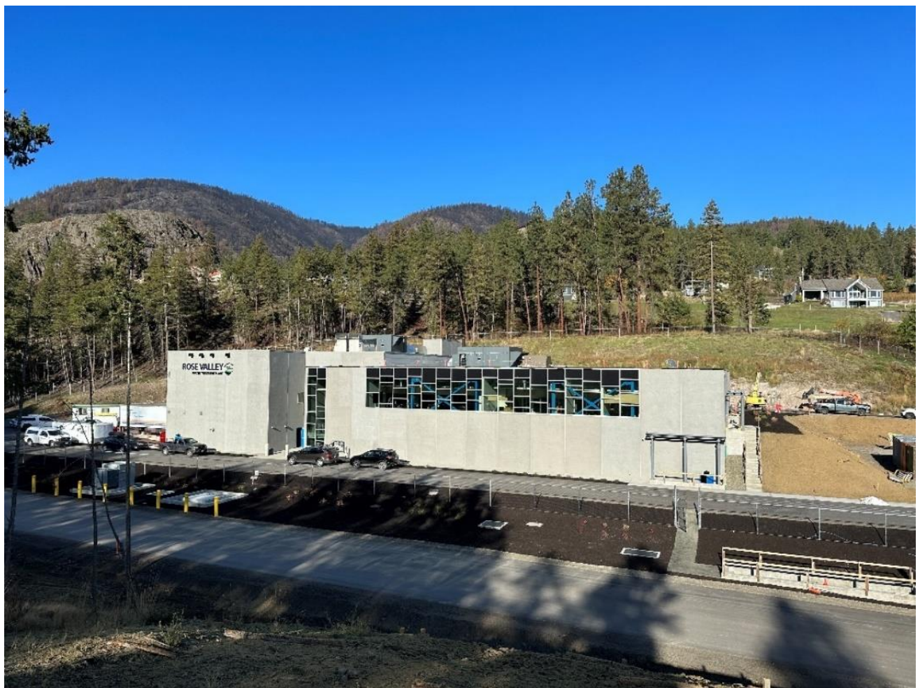
Figure 1. Rose Valley Water Treatment Plant

During this process water will be fully treated through the new facility and will be delivered to residents in the Rose Valley – Lakeview system. This is expected to begin before the end of November. Residents will receive water exceeding Federal and Provincial Drinking Water Guidelines. The Rose Valley – Lakeview system serves an estimated 12,850 people.