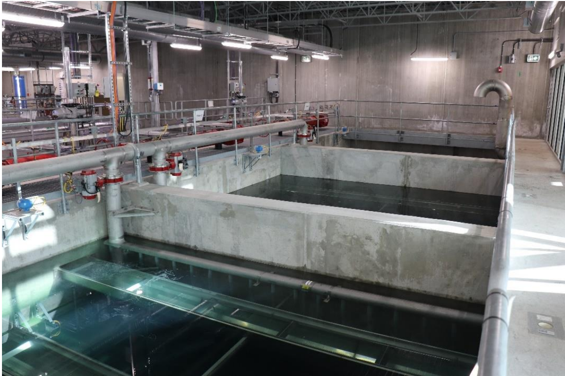
Figure 3. Filter Tanks