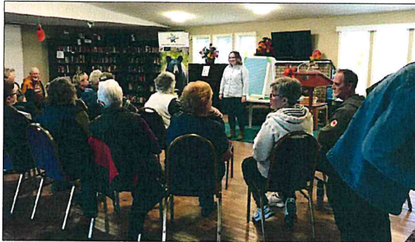
Community forum on human-wildlife conflicts for residents of Crystal Springs mobile home park

Keeping Wildlife Wild and Communities Safe