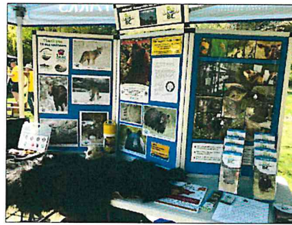
Go Fish Event at Shannon Lake

Keeping Wildlife Wild and Communities Safe