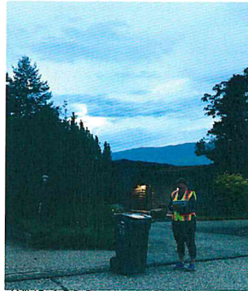
WildSafeBC Community Coordinator Garbage Tagging in Rose Valley

Keeping Wildlife Wild and Communities Safe