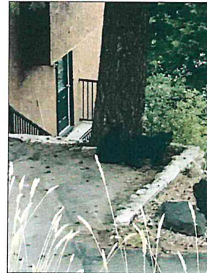
2 bear cubs in a West Kelowna neighbourhood

Keeping Wildlife Wild and Communities Safe