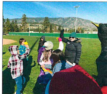
Students participating in the extended WildSafe Ranger Program

Keeping Wildlife Wild and Communities Safe