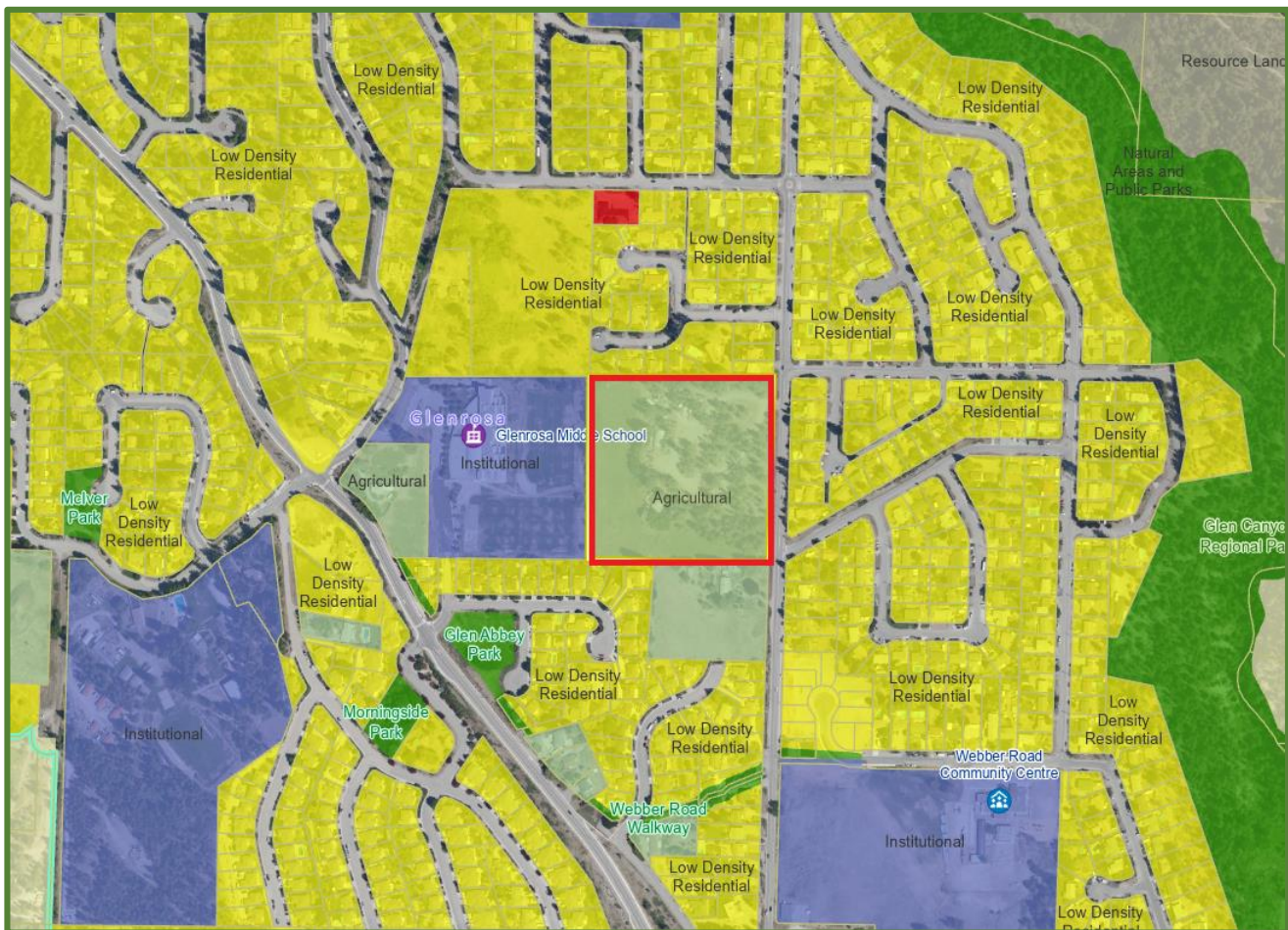
Figure 2: Land Use Designation Map