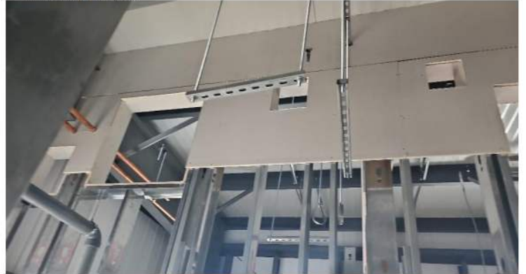
Description Insulation and Drywall