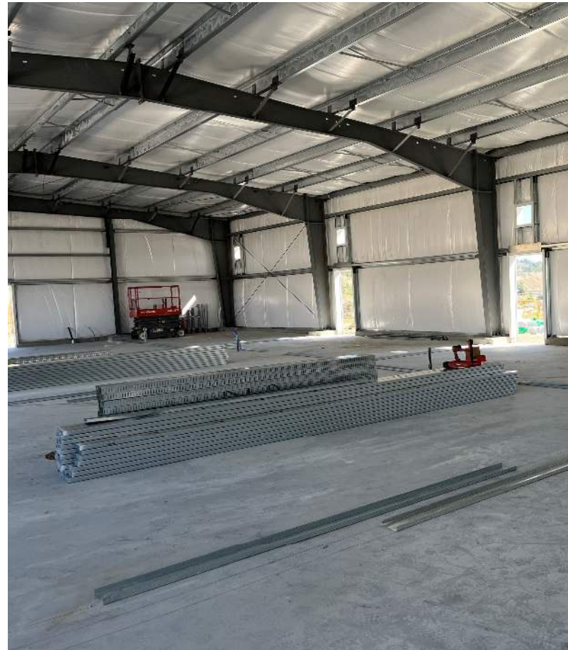
Workshop interior showing completed slab and ongoing steel wall tracks