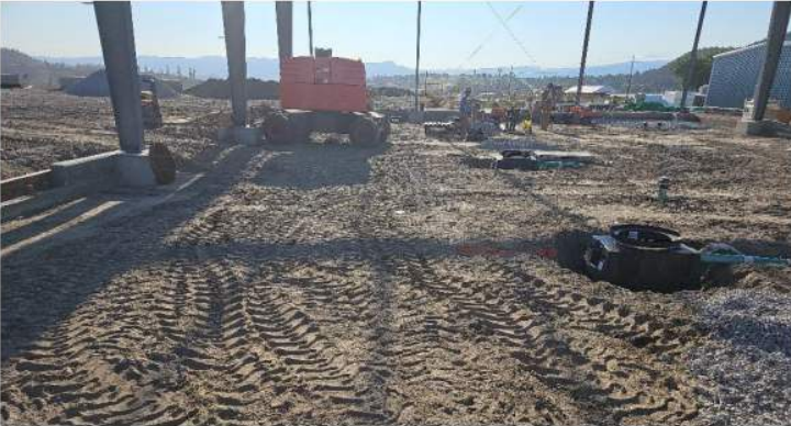
Description Steel Stud Tracks