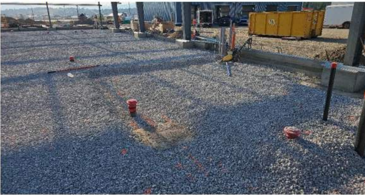
Description Slab Prep