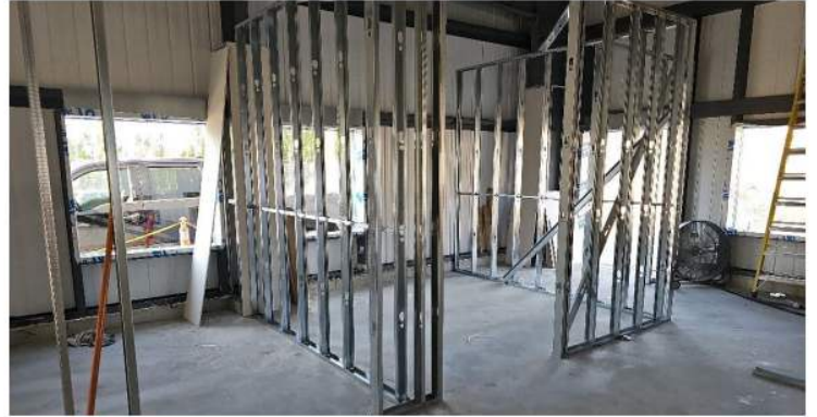
Description Steel Studs