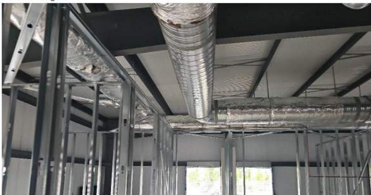
Description HVAC Rough In