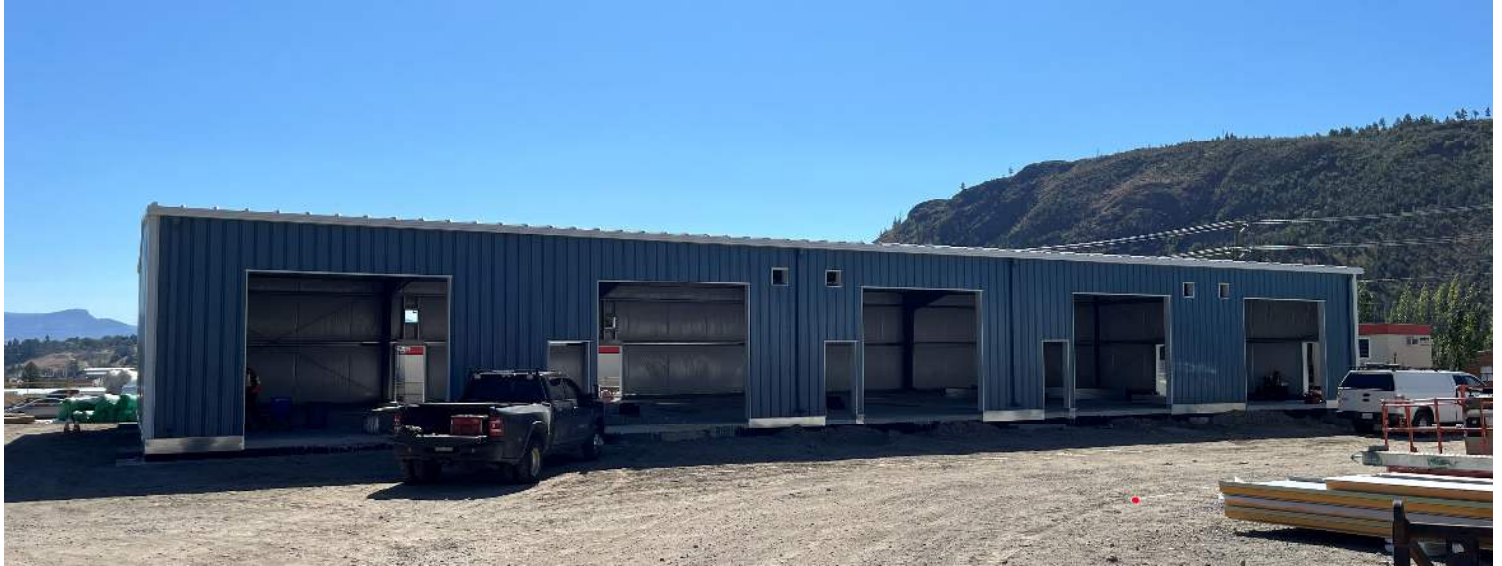
Workshop building on Aug 1, 2024