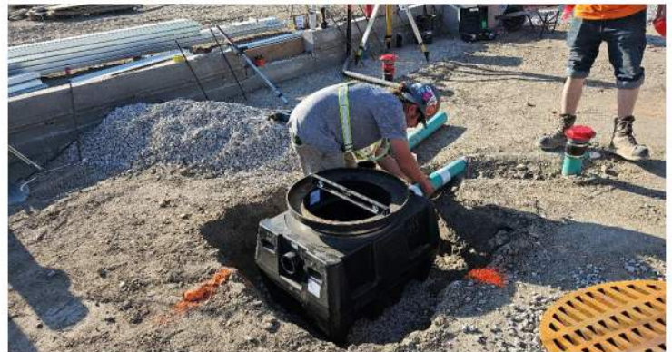
Description Under Slab Drainage