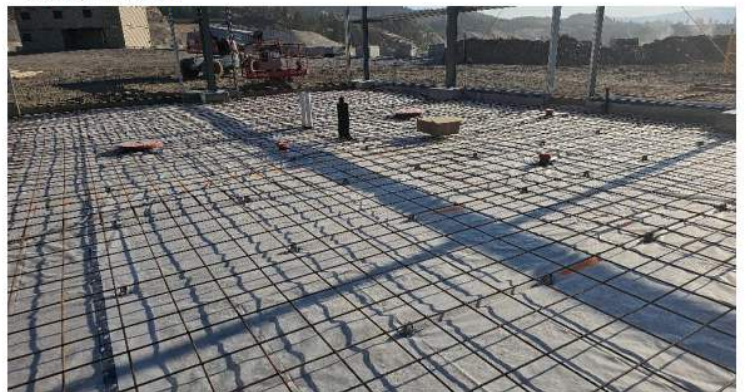
Description Steel Reinforcement