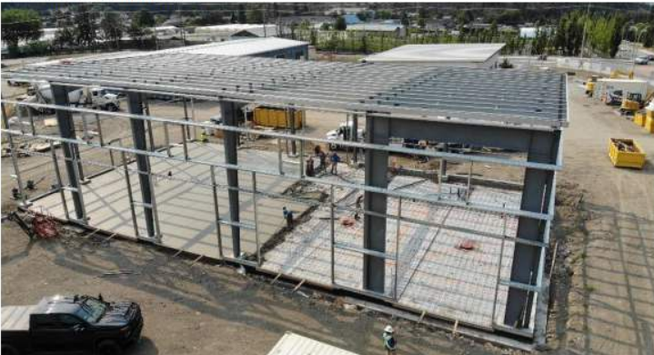
Description Concrete Pour from Drone