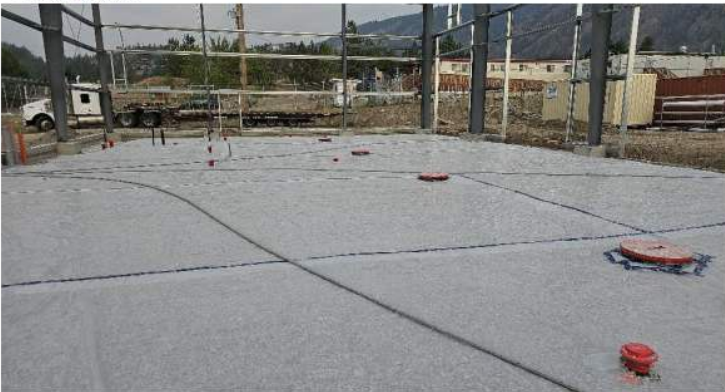
Description In Slab Services