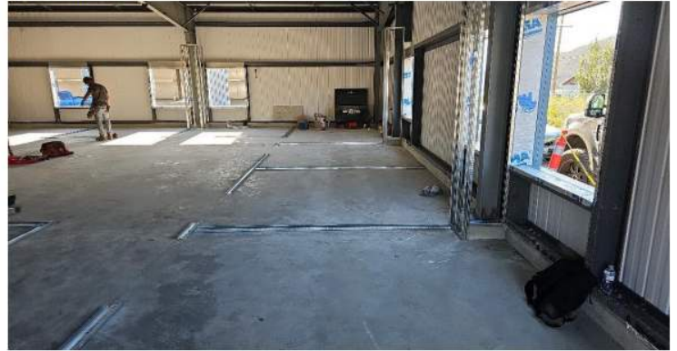
Description Steel Stud Tracks