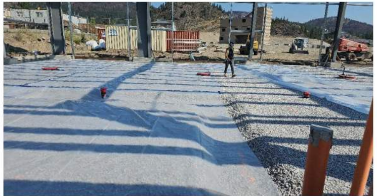
Description Polythene Vapor Barrier