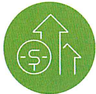
Economic Growth and Prosperity

We will provide opportunities for the residents of West Kelowna to build connections, celebrate successes, embrace the community's strengths and diversity, address shared needs, and contribute to shaping the community's future.