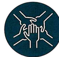
Strengthen Our Community

We will invest in building, improving and maintaining quality infrastructure to meet the needs of, and to provide a high quality of life for, current and future generations.