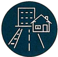
Invest in Infrastructure

The City of West Kelowna Municipal Council has identified four pillars to help guide the use of city resources, and to organize the city's strategic priorities.