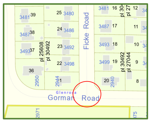
Figure 4: Approximate crosswalk location (design TBD)

Kerr Properties undertook a Traffic Impact Assessment. Based on reporting, staff have requested the establishment of a marked, signed and illuminated crosswalk at the corner of Gorman Road and Ficke Road (Figure 4) with advance warning on the MacTaggart Road approach. An additional crossing has also been requested between Webber Road and Lyon Road to ensure a safe crossing to the bus stop at the intersection of Webber Rd and Aberdeen Rd. These will be considered as potential conditions of zoning adoption.