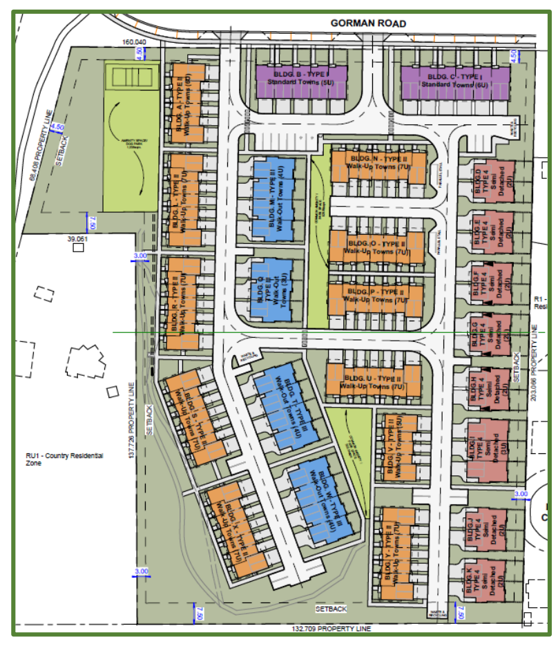
Figure 1: Proposed Site Plan