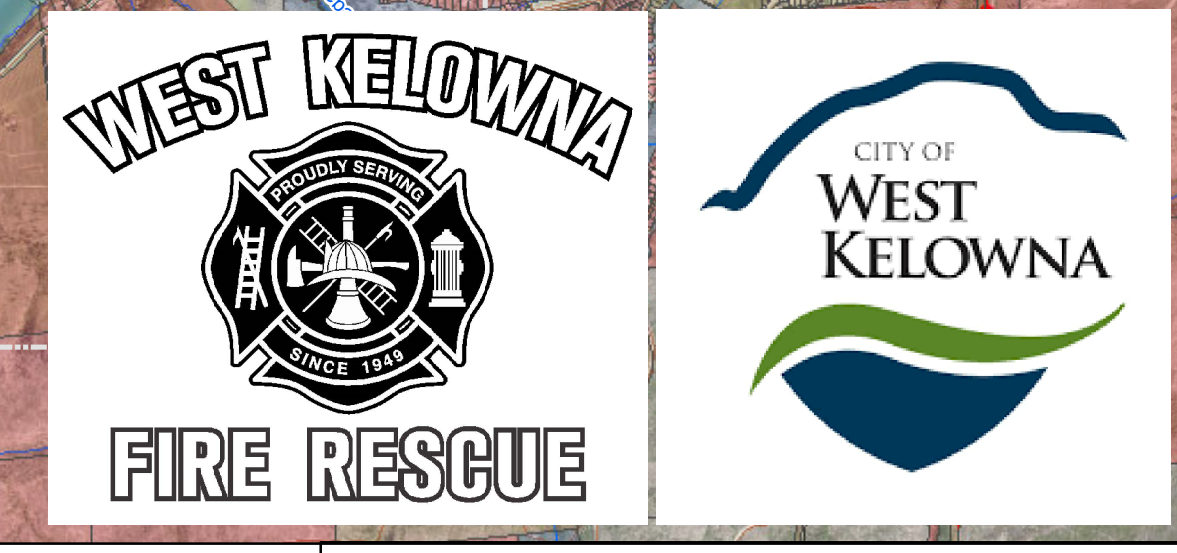
City of West Kelowna - Community Wildfire Resiliency Plan - Map 3: Proposed Fuel Treatments