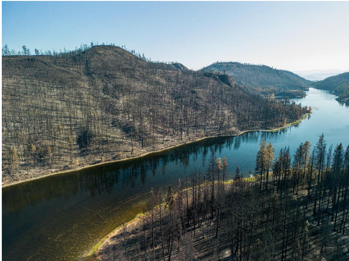
Figure 1: Rose Valley Reservoir Watershed After the McDougall Creek Wildfire

The source water quality in the Rose Valley Reservoir has experienced changing conditions over time and more source water quality challenges are expected. Increased human caused activity, climate change, and wildfire are placing additional impacts to the watershed. Algae growth has increased along with turbidity, iron related bacteria, and manganese. The McDougall Creek wildfire impacted approximately 98% Rose Valley Reservoir's immediate watershed. This is the last natural buffer and the most critical area as it is closest to the intake that travels directly to the plant. Water quality impacts from the wildfire are expected to last at least five years and will exacerbate existing issues with the water source.