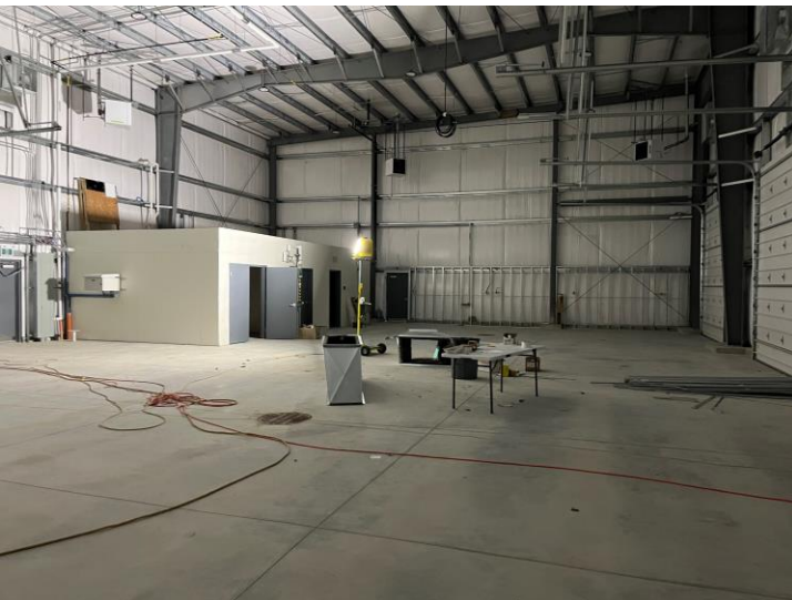
Interior main area