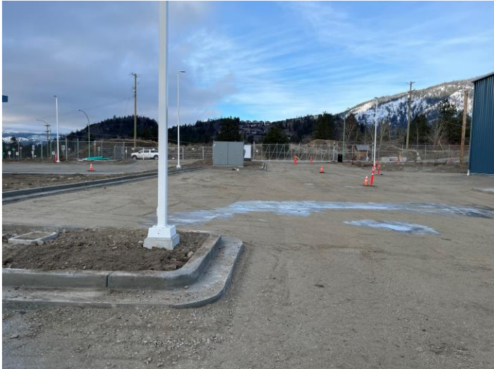
Grading complete from main entrance and between buildings, sub-base installed