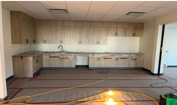
Kitchen cabinets - altered to allow space for coffee machines