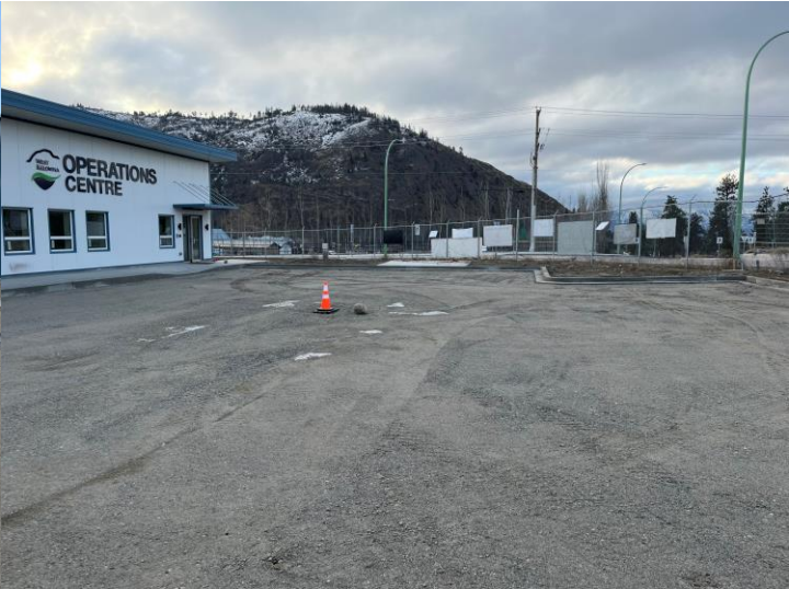
Grading and sub-base complete for Admin parking lot, berm removed, fencing installed