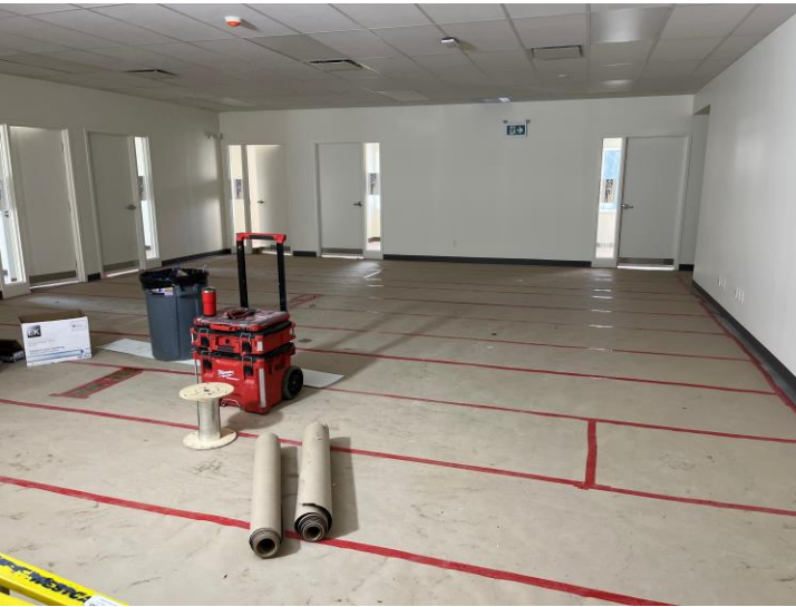
Workstation area - floors protected for final paint touchups