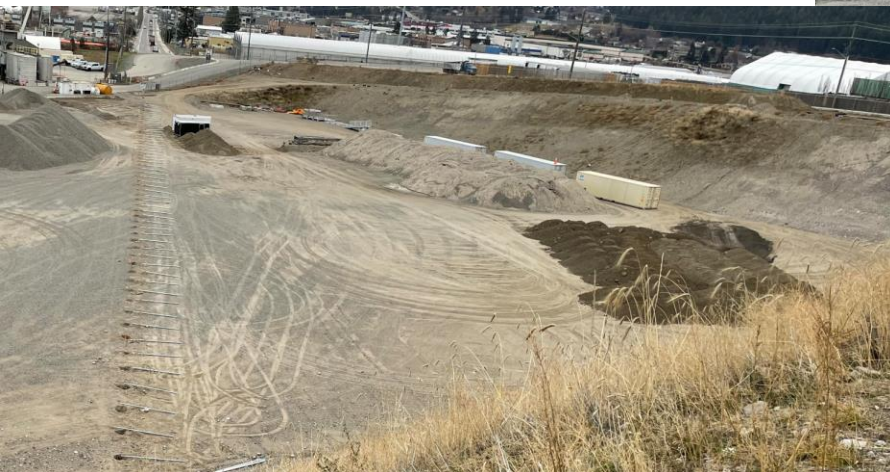
Fence line being installed, remaining piles of backfill to potentially be used in soft spots at upper yard. Storage sea cans in position along ridge.