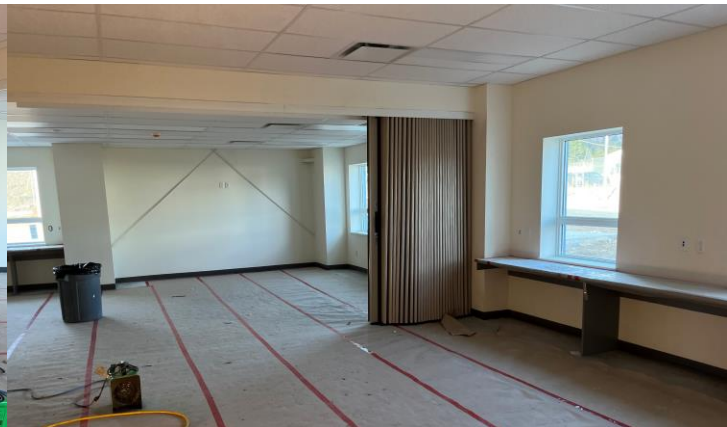
Lunch room/meeting room with dividing wall installed