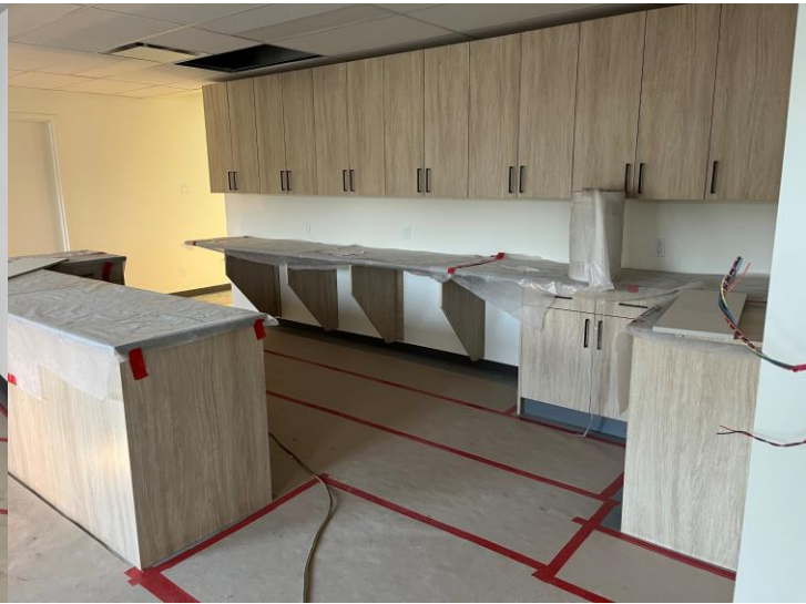
Copy room cabinetry