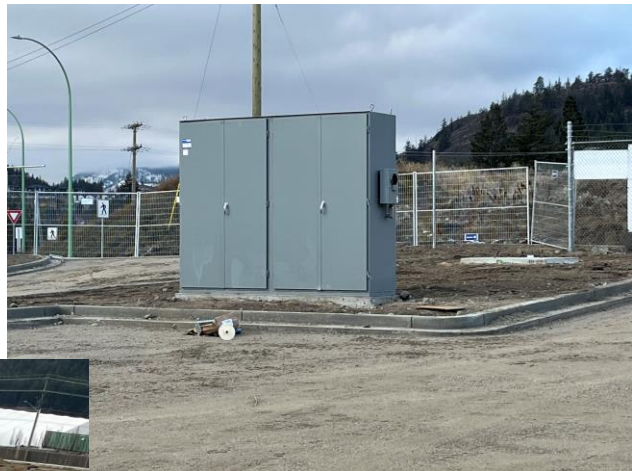
Electrical kiosk installed