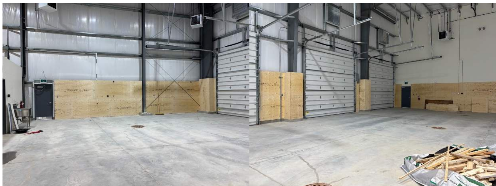
City installation of plywood inside for mounting