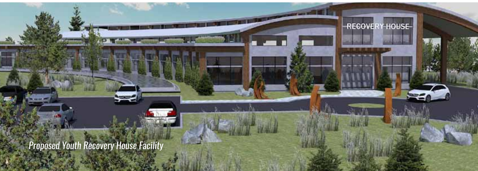
Proposed Youth Recovery House Facility

Family members and caregivers face unique challenges when supporting a loved one struggling with substance use disorder and can be an extremely valuable resource in a person's addiction care and recovery. They will therefore be involved in the recovery process and receive knowledge, skills and support during and after treatment.