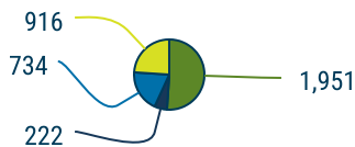
2025 Q4 ZONE COMPARISONS

● WEST KELOWNA ● PROVINCIAL (excluding WFN) ● PEACHLAND ● PROVINCIAL (WFN)