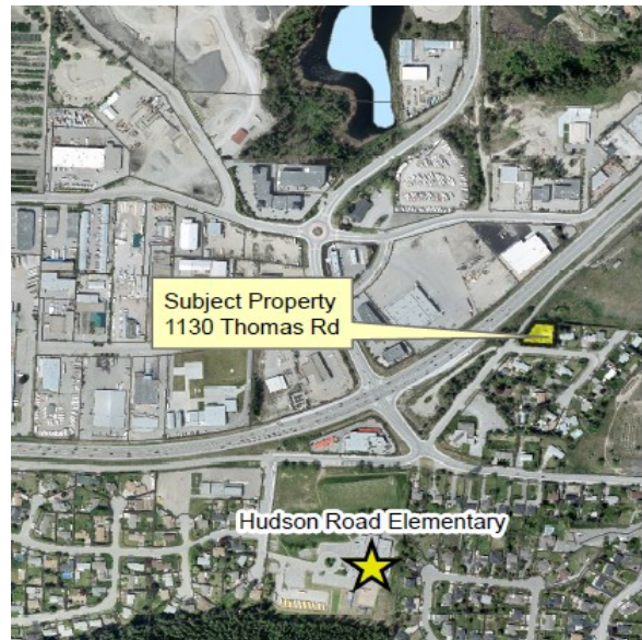
Figure 1: Context Map

The applicant is proposing to rezone an 800 m 2 portion of the subject property from the Single Detached Residential Zone (R1) to the Duplex Residential Zone (R2). The intent of the rezoning is to support a two (2) lot subdivision and subsequent duplex development. A subdivision application has been submitted concurrently with the rezoning application; however, issuance of a Preliminary Layout Review (PLR) is subject to rezoning approval, as conditions of the PLR will be specific to the proposed R2 Zone as opposed to the existing R1 zone. The applicant has submitted a preliminary layout identifying the 800 m 2 portion of the property proposed for rezoning and subdivision ( Figure 2, Attachment 3 ).