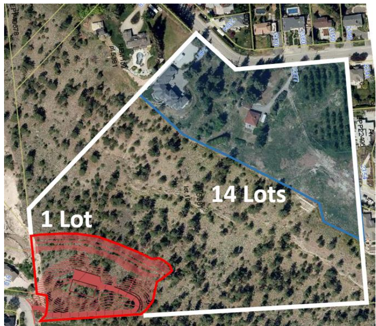
Figure 2. Disturbance Area and Size Comparison

As additional detailed rockfall review has taken place, it has been identified that the level of disturbance required to accommodate the development of the lower portion is larger than the proposed rezoning boundary. It is not typical that the required level of disturbance to an ESA 2 area for one single-family lot be permitted. It is therefore recommended to move forward with the upper development site only.