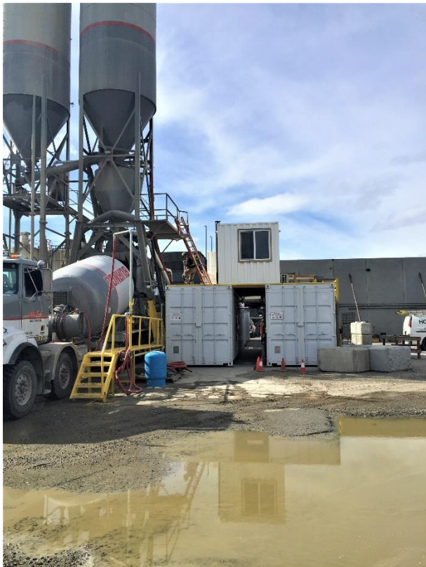
Figure 3 - Side View of stacked containers