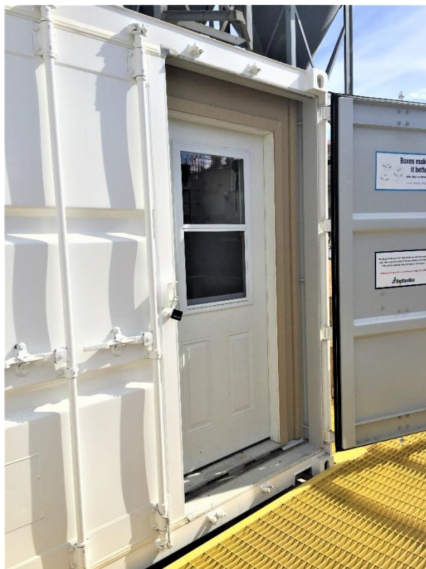
Figure 6 - Container #3 - Batch Office (stacked)