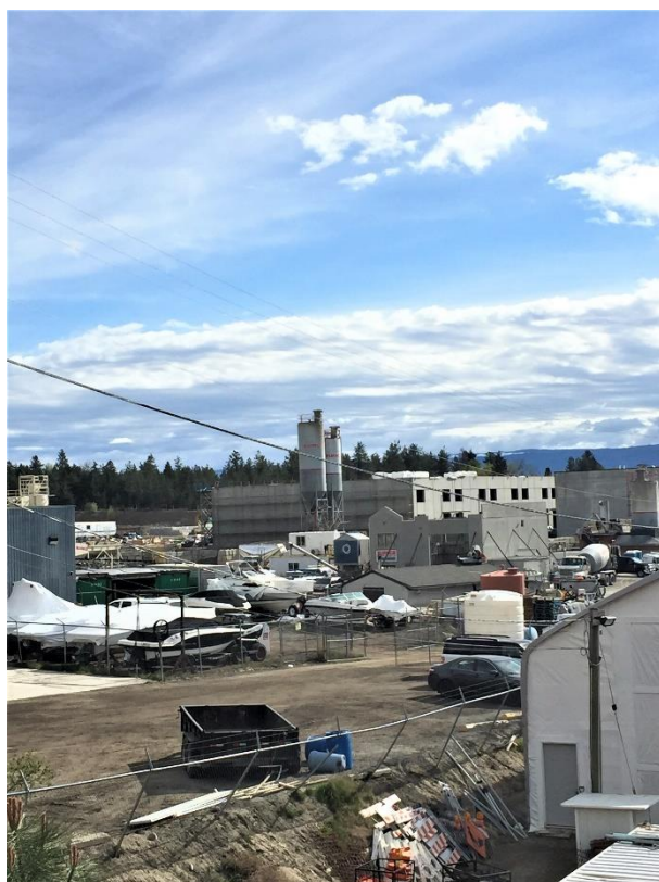
Figure 8 - Site Photo (from Auburn Road)