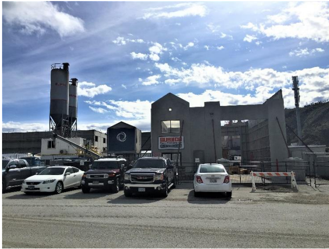
Figure 1 - Site Photo (from internal road)

File No: DVP 20-04 Location: 2659 Auburn Road (2575 Auburn) Legal: Lot 2, DL 2601, ODYD, Plan KAP54083, Except Plan KAP69132 Owner: Far Forty Holdings Ltd. Agent: Burnco Rock Products Subject: DVP 20-04, Burnco Rock Product, Auburn Rd