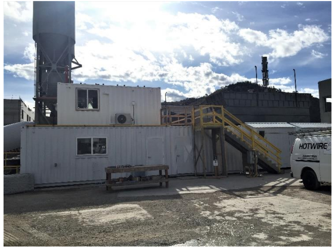
Figure 2 - Shipping containers installed on site