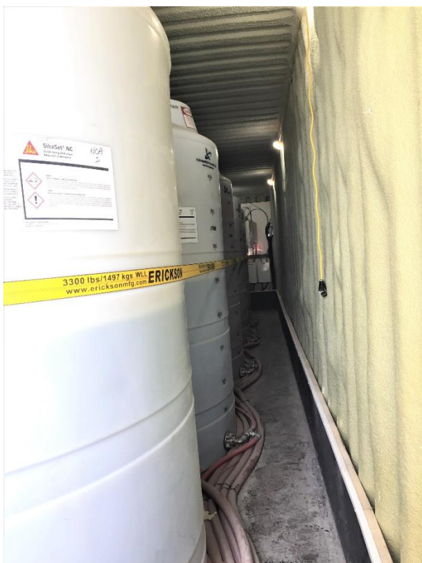
Figure 7 - Container #4 - Admixture Storage