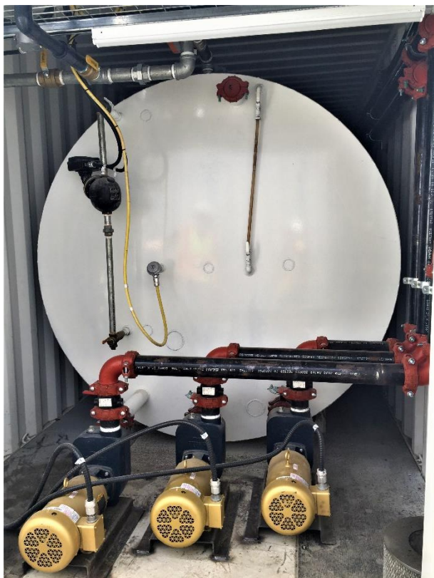
Figure 5 - Container #2 - Water Tank & Steam Generator