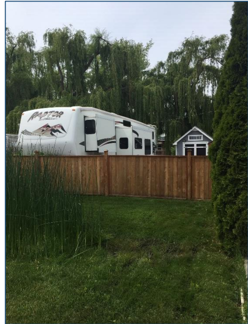
Figure 1 - View of Site #15A from Green bay Road

The applicant has provided a letter ( Attachment 2 ) which summarizes their rationale for the extended renewal period. The applicant states that the tenants who occupy the RV on site #15A maintain the site in a tidy appearance, are quiet and help the neighbours. The applicant feels that due to the Provincial State of Emergency due to COVID-19, that they are unable to evict the RV tenants. The applicant has also provided rationale that the demand for alternative housing will have increased due to the pandemic and that two years could be how long it takes for things to return to normal.