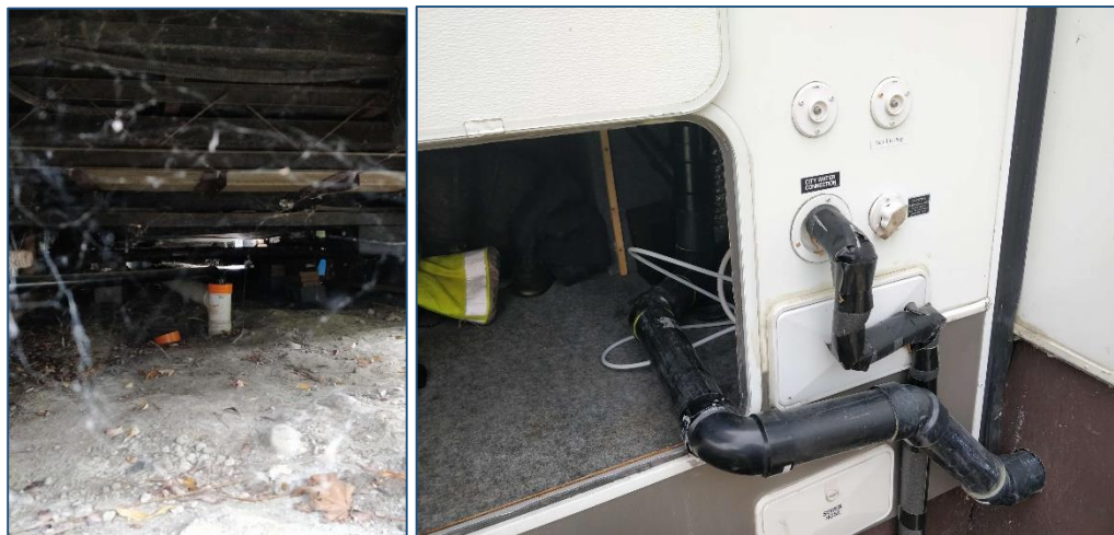
Figure 2 - Sanitary Service Connection

There is an insulated water connection and a sanitary connection underneath the RV. The field review of the service connections during a site visit did not result in any required upgrades or changes to the existing connections. The condition from TUP 18-05 requiring the sanitary connection to be inspected has been satisfied.