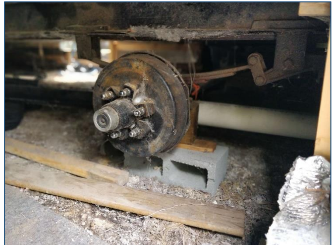
Figure 3 - RV Skirted and Wheels Removed

It is recommended to renew the TUP for a period of up to six months after the Provincial State of Emergency is lifted. This would allow at least 1-2 months outside of the winter season for the RV to be relocated no matter when the state of emergency is lifted, understanding that moving in the winter could be challenging.