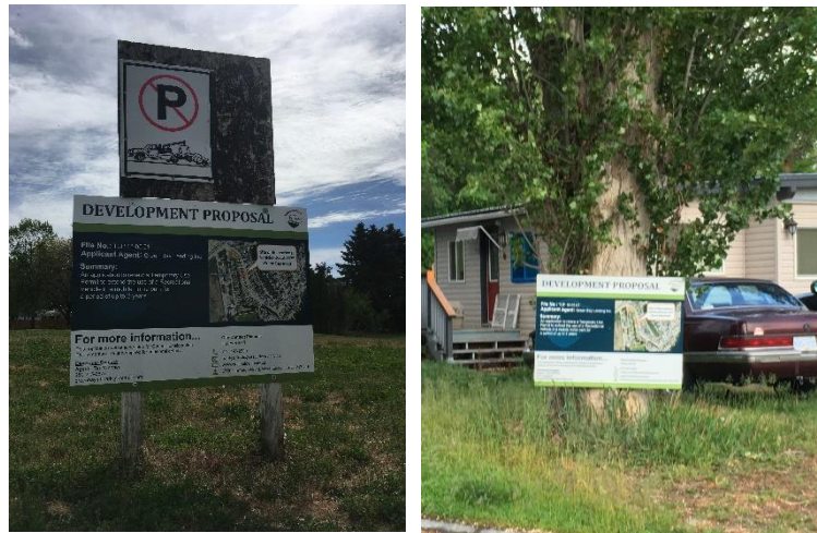
Figure 4 - Notice of Application Signs

Two Notice of Application Signs have been installed on the subject property in accordance with the City's Development Applications Procedures Bylaw No. 0260. Staff have received correspondence from three neighbouring residents opposed to the continued use of the RV and feel RV use should be located within a campground as opposed to a mobile home park.