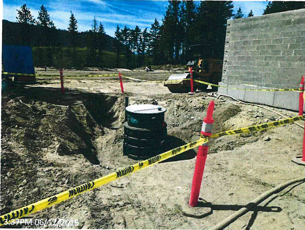
Figure 1 – Sanitary Sewer Lift Station Installed (East of washroom)