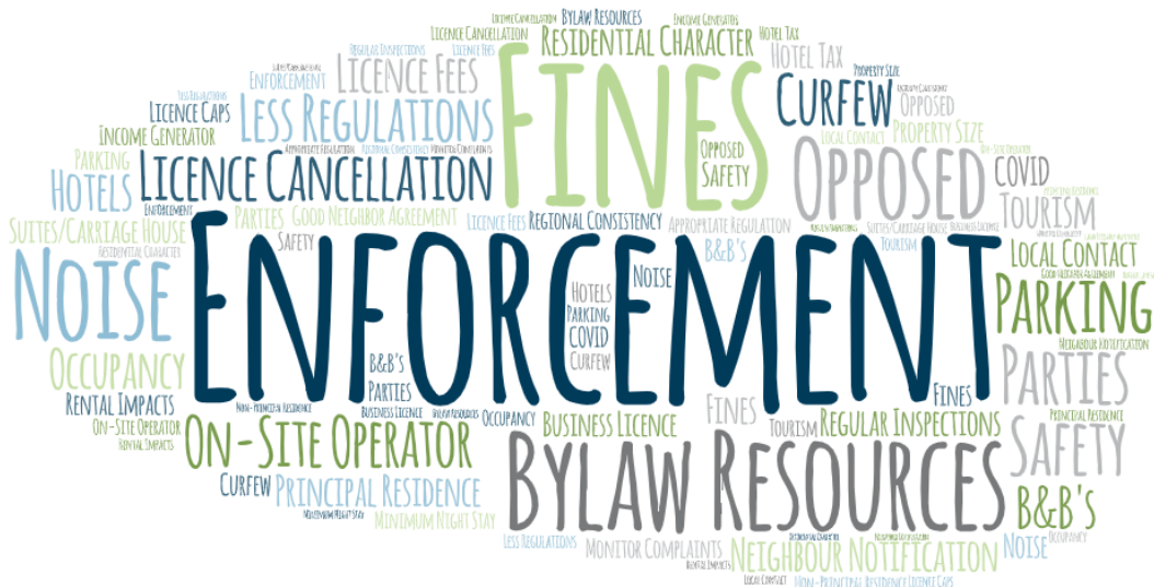
Measure Relative Cost (approx.) Enforcement 19 Fines 13 Bylaw Resources 10.5 Licence Cancellation 10.5 On-Site Operator 9 Less Regulations 9 Opposed 8.5 Noise 7 Neighbour Notification 5.5 Parking 5.5