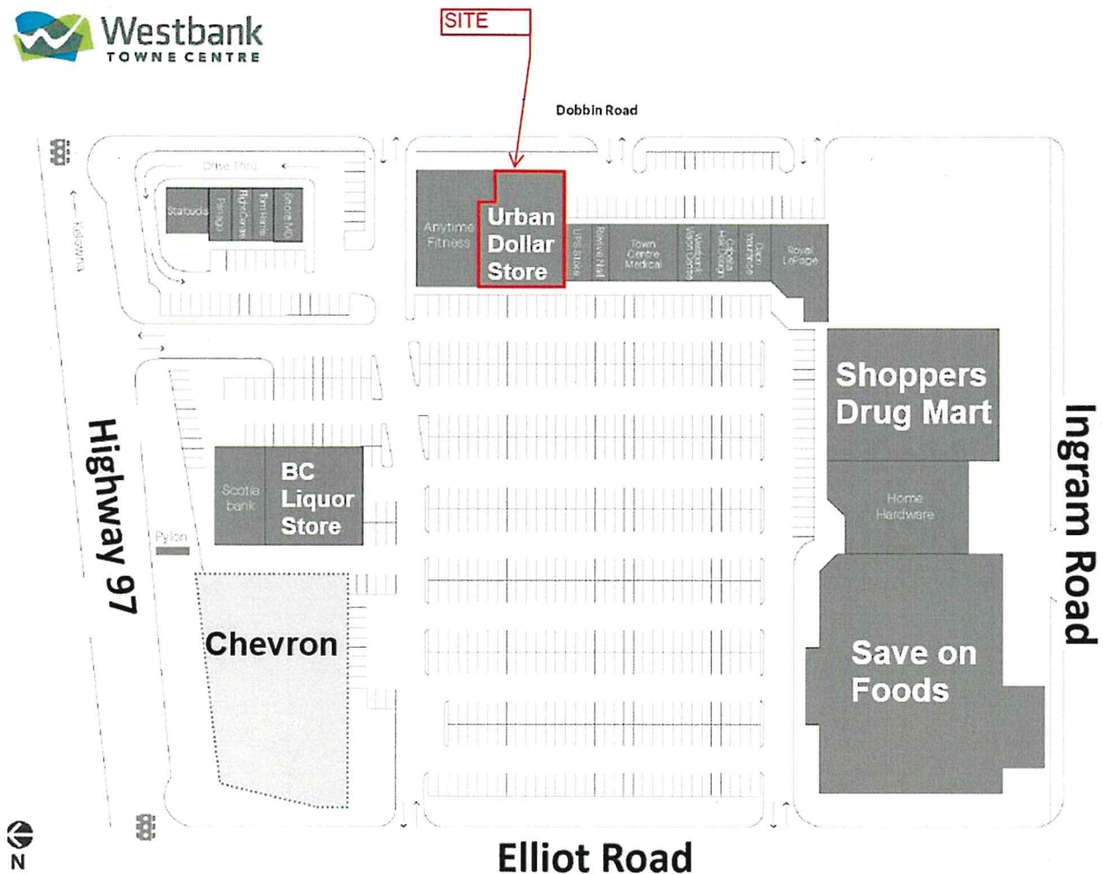
Figure 1. Proposed BC Cannabis Outlet Location

The proposed Government operated cannabis retail outlet would be located in a 7,116 ft 2 , C1-Urban Centre Commercial Zoned Unit within the Westbank Town Centre complex (2475 Dobbin Road) (Figure1.).