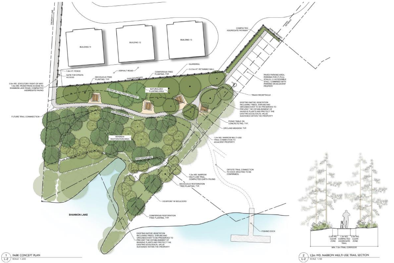
Figure 5: Proposed Future Park Area to be constructed as per Covenant CA7432658

park improvements. If there are significant impacts to the proposed park improvements, the Park Covenant (CA7432658) will need to be revised to include new drawings and cost