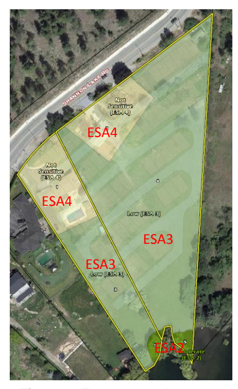
Figure 4: Environmental Sensitive Areas

The applicant will be required to construct the required works prior to development of the lands, however, additional stormwater review is underway to confirm proposed emergency flow routes will not impact the