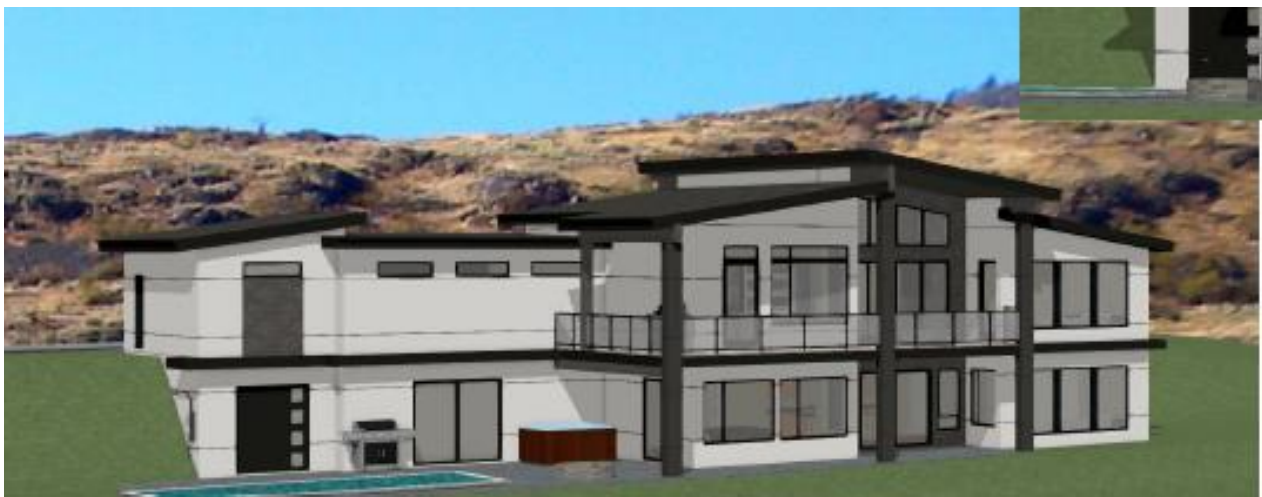
Figure 2: rendering from rear (Diamond View Drive)