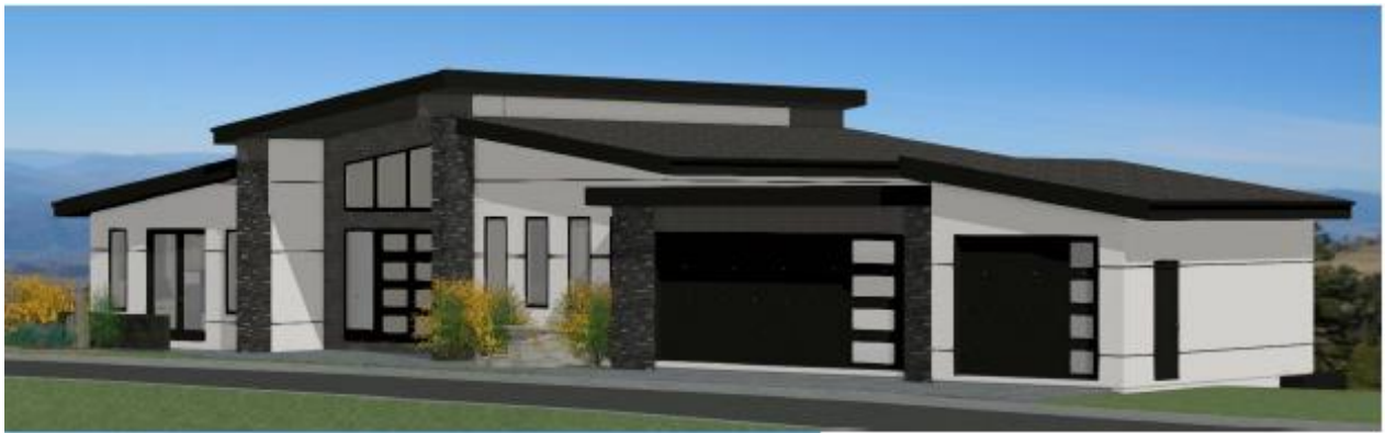
Figure 1: rendering from front (private access easement)

The applicant is proposing to reduce the minimum setback from the private access easement to a proposed dwelling from 4.5 to 3.86 and to the garage from 6.0 m to 3.01 m ( Figures 1-3, Attachment 1 ). A variance is required to accommodate the proposed building envelope due to existing steep slopes and geotechnical covenant.