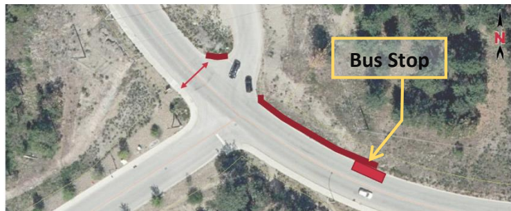
Figure 3 - Connect Northbound Bus Stop with Sidewalk and Letdowns to Saddleback Way

To accommodate sightline restrictions on Asquith Road from the Westside Transfer Station access road, it is proposed that a sidewalk cross to the northwest side of the access road. Construction of a concrete landing, sidewalk connection with letdowns, and lit crosswalk are recommended (Figure 3). These upgrades will be recommended to be completed as a condition prior to adoption of the rezoning.