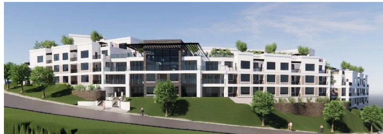
Figure 2 - Concept Rendering - Seniors Congregate Housing in Apartments

This application is proposing a site specific text amendment to permit congregate housing on the subject property. The amendment is required in order to facilitate a senior's congregate housing development within an apartment form ( Figure 2 ).