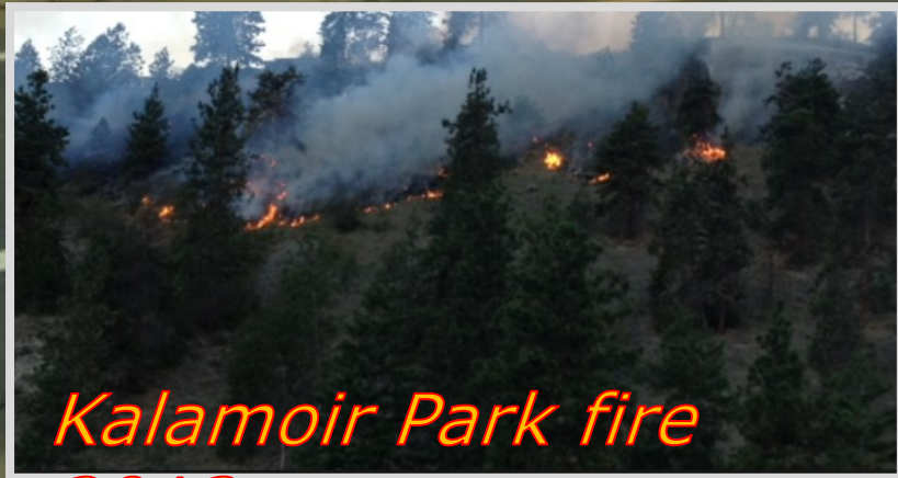
Kalamo Park fire

Growing Traffic Issues + Extreme Fire Hazard Potential + Undersized infrastructure = Danger for Residents