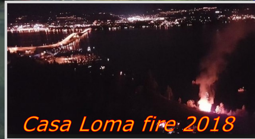
Casa Loma fire 2018