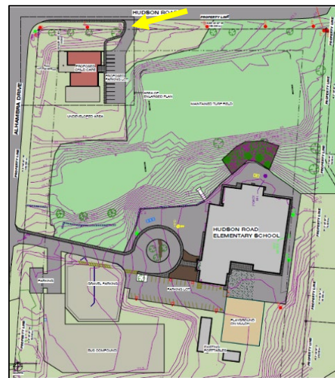
Figure 2b. Site Plan (yellow arrow depicts photo location/angle). Detailed site plan(s) are attached.