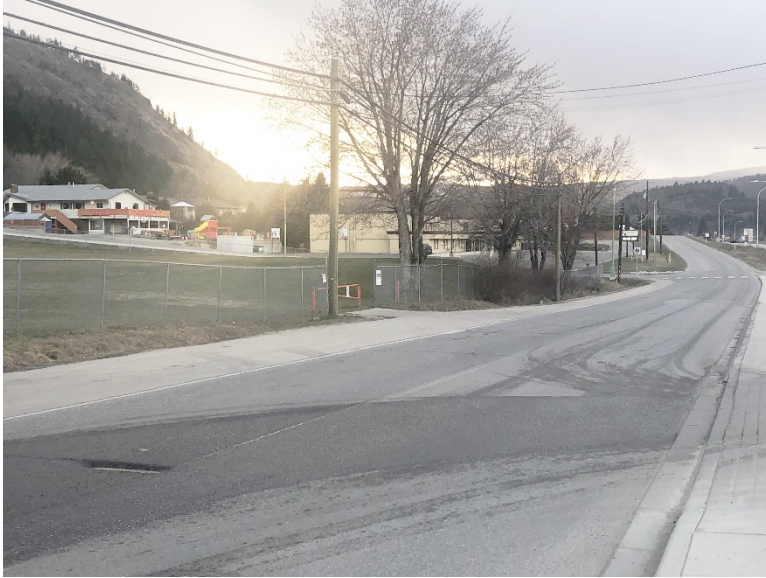
Photo 1 taken from Hudson Rd looking towards intersection of Hudson Rd and Alhambra Rd.