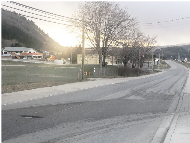
Figure 2a. Photo taken from Hudson Rd looking towards the intersection of Hudson Rd & Alhambra Dr.