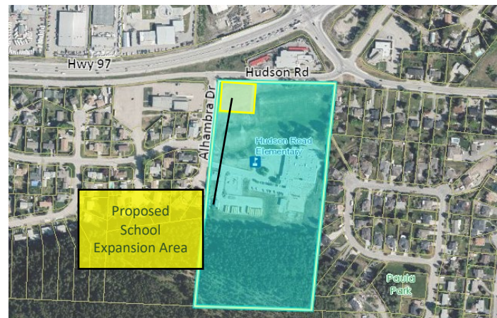
Figure 1. Context Map

The proposal is to allow the School District to construction of a 500m 2 (5,382 sq.ft) early learning program facility on the northwestern corner of the elementary school property. The facility will create 30 new childcare spaces and will accommodate both daycare and pre- and after-school programs. In keeping with other School District owned childcare facilities, this facility will be run in partnership with the Okanagan Boys and Girl's Club.