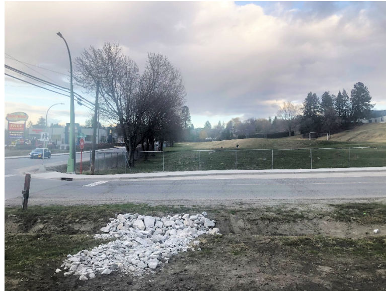
Photo 2 taken from Alhambra Rd looking east towards proposed early learning centre location.