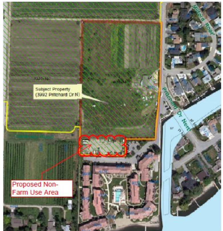
Figure 1: subject property and non-farm use area (“Row F”)

Since 2005, the property has informally been used by Barona Beach Resort as a dog park, smoking area, and garbage and recycling storage.