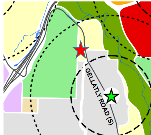
Figure 1: “Neighbourhood” GMD (property indicated by red star)

The subject property is within a Hillside Development Permit Area, due to existing slopes over 20%. As a result, a geotechnical report was submitted with the application to confirm development feasibility. If the application is successful in amending the land use and zoning designations, a hillside development permit would be required prior to development of the site.